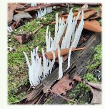
A. FAIRY FINGERS B. WHITE WORM CORAL C. WHITE SPINDLES D. ALL OF THE ABOVE