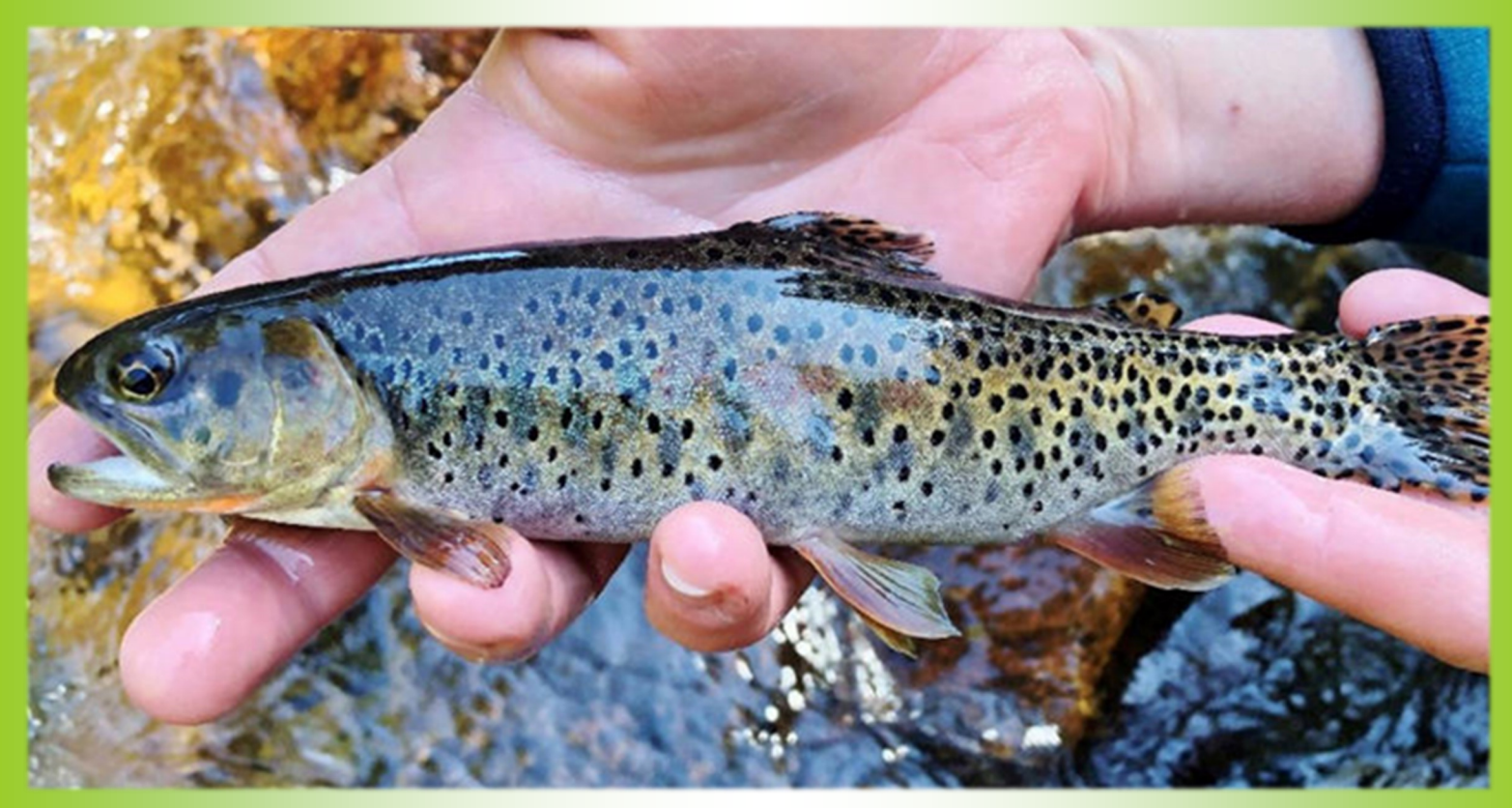
A picture shows a greenback cutthroat trout, a species once thought extinct.

A species considered extinct for nearly 100 years has been brought back to life in Colorado.