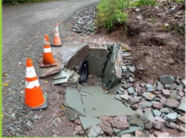
<u>Picture 3:</u> Inlet of new pipe showing large rock used as a headwall to turn water into the pipe.

Environmentally, we are saving tons of sediment from running into the stream before it can cause any pollution events when it rains. Our total cost for the project came out to $17,147. Hopefully this road won't be an issue again for a very long time.