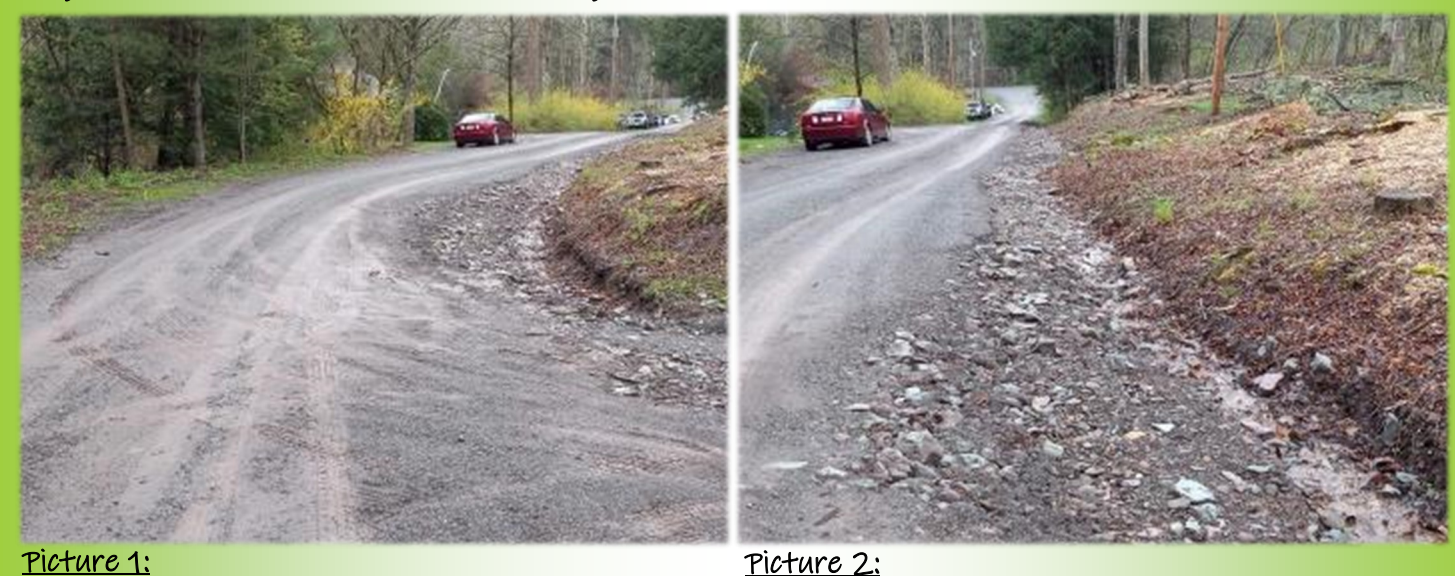
Taking picture near inlet of pipe under road showing where the water leaves the channel & begins flowing down the road.

The issue is the same one that we see here in the county in many different places, there is a fairly large drainage area with some very steep mountains & all the runoff is coming down one small stream. Usually, the small streams stay within their banks and the pipes that are in place, where the stream flows under the road, can handle the amount of water. Other times, during some of the flash thunderstorms, the water comes rushing down the hillside & overwhelms the pipes that usually handle the flow. The water jumps over the pipe, tears down the road & the roadside ditch leaving only the largest of rocks still in place and depositing the