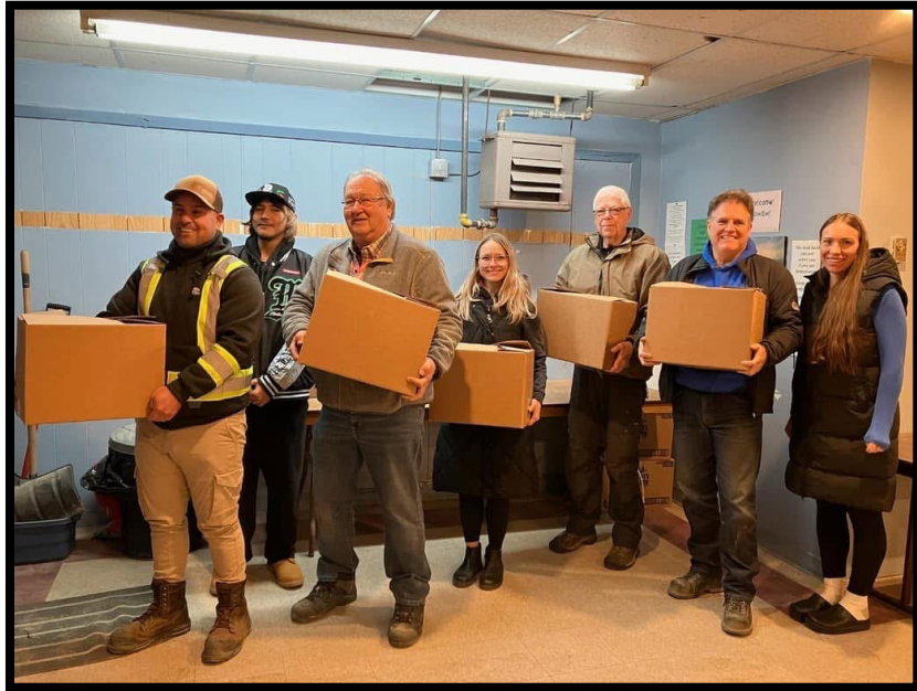
Ledcor Group with Lac La Ronge Food Bank