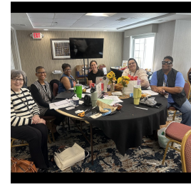
Members of MAEOP having fun during a break