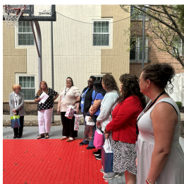
Friendship gift exchange