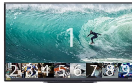
MODE 6: 1 Large and 8 small HDMI input segments.