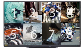
MODE 7: 8 Averaged HDMI input segments.