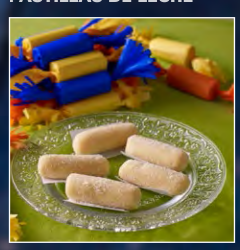
Ingredients: 2 1/2 cups powdered milk 1 cup condensed milk White sugar for coating