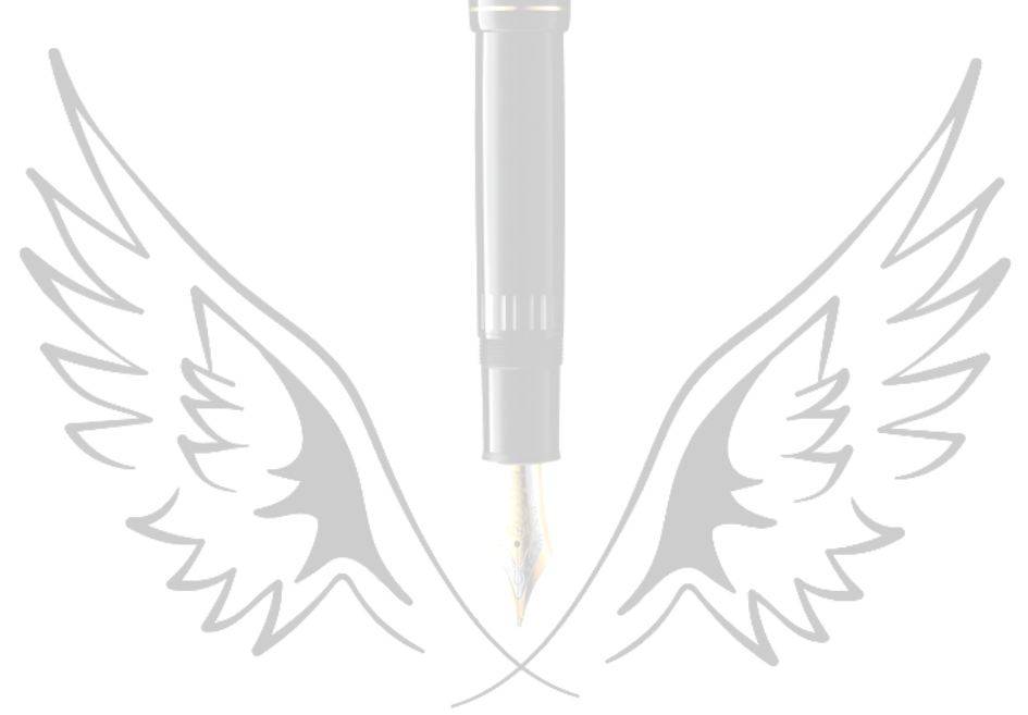
Jurisperitus: The Law Journal

project have been adoption successfully . The service like DigiLocker is now being used by four million users. The MyGov application which provides a platform for citizens to interact with the government is used by over one million users to interact with the government. India now represents the second largest internet user base in the world. This provides a significant opportunity to transform the lives of the citizens through digital technologies. The Digital India program is likely to benefit citizens over the next few years by generating employment opportunities, increasing speed and quality of service delivery and enhancing social and financial conclusion. Businesses will benefit by realizing higher productivity, an improved ease of doing business and a boost in innovation and investments. The adoption of next generation technologies under Digital India such as telepresence .