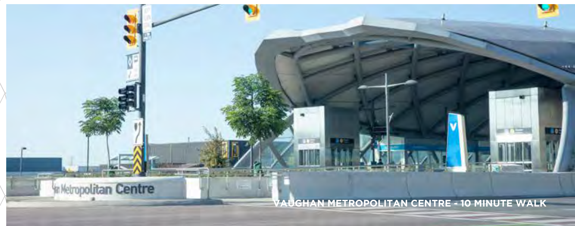
VAUGHAN METROPOLITAN CENTRE - 10 MINUTE WALK