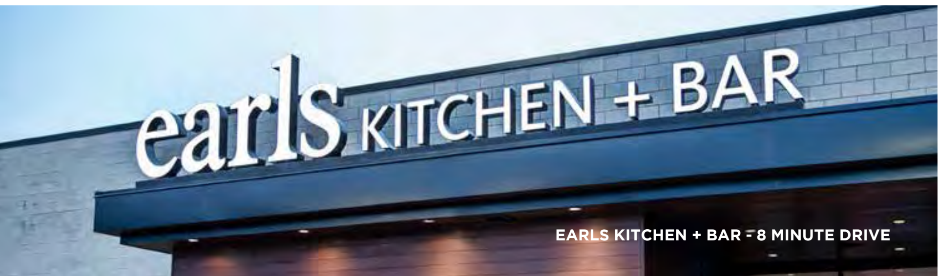
EARLS KITCHEN + BAR - 8 MINUTE DRIVE