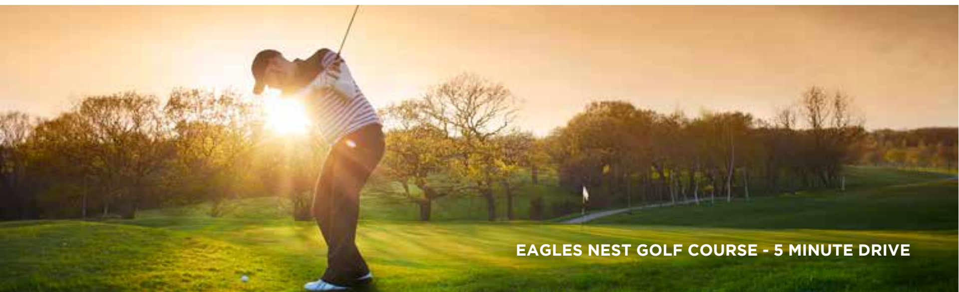
EAGLES NEST GOLF COURSE - 5 MINUTE DRIVE