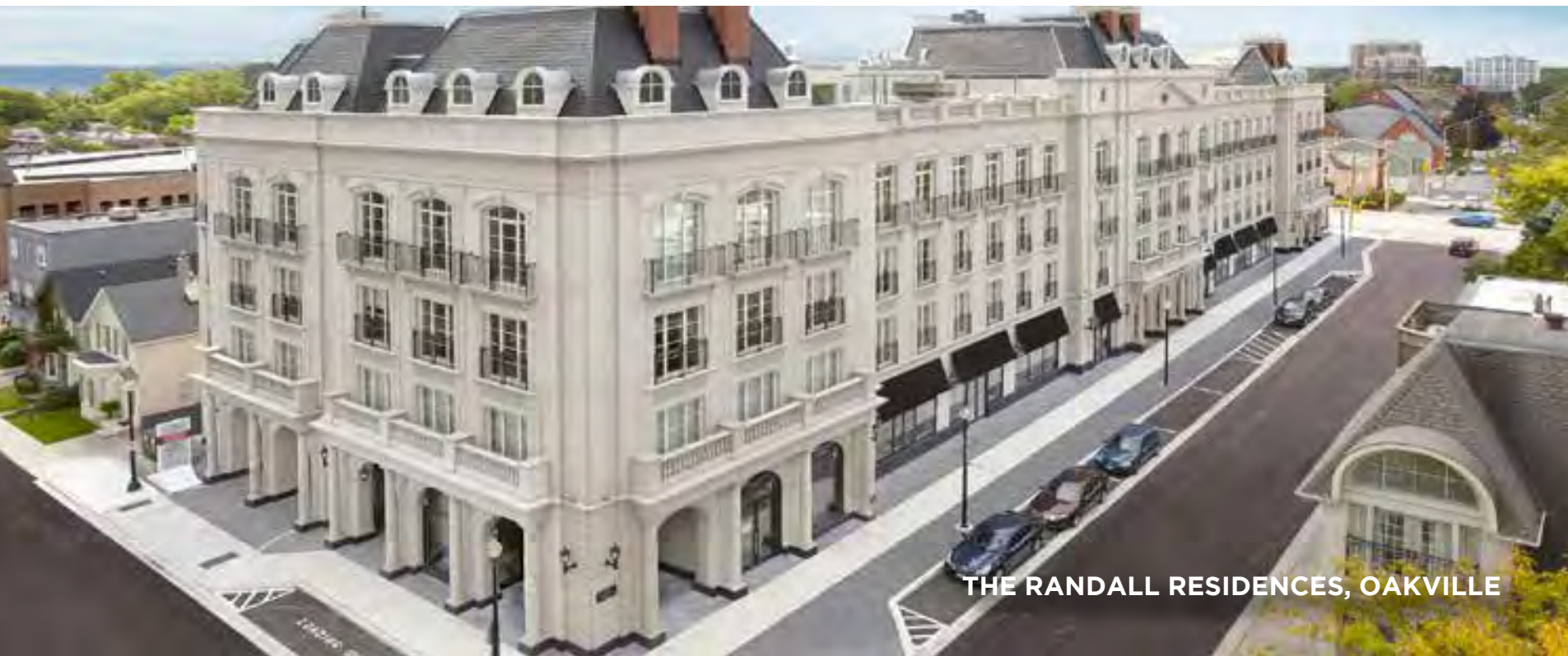
THE RANDALL RESIDENCES, OAKVILLE