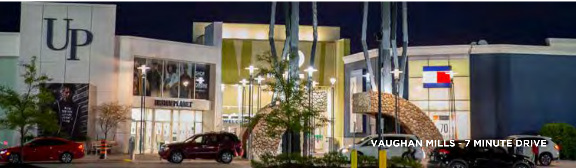
VAUGHAN MILLS - 7 MINUTE DRIVE