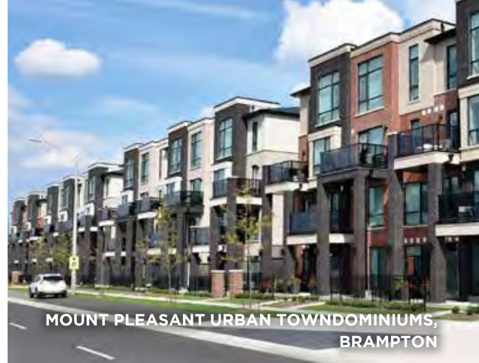
MOUNT PLEASANT URBAN TOWNDOMINIUMS, BRAMPTON