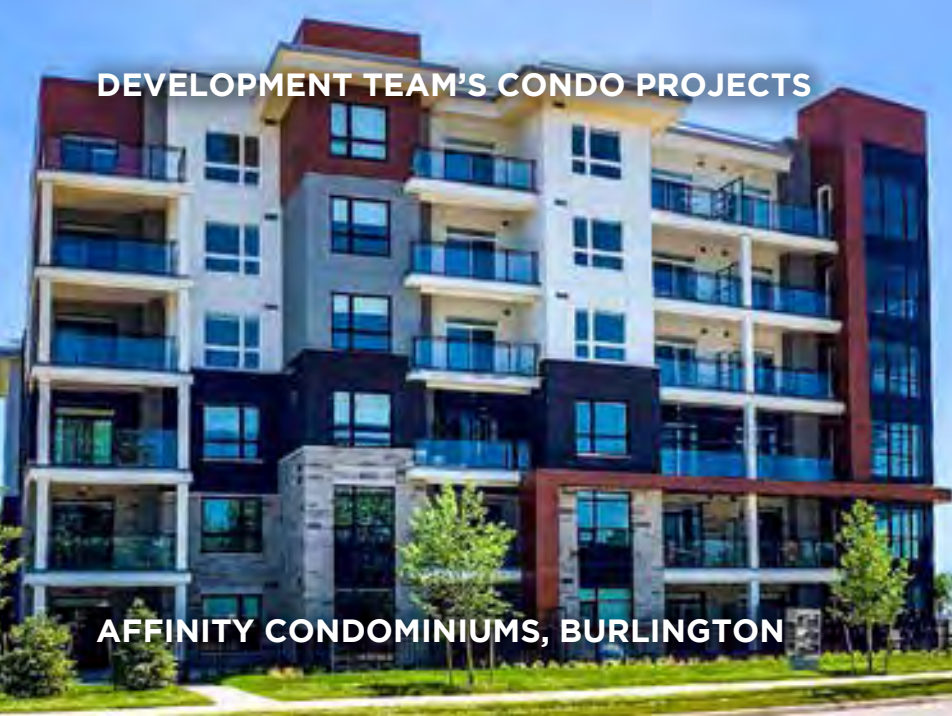
DEVELOPMENT TEAM'S CONDO PROJECTS