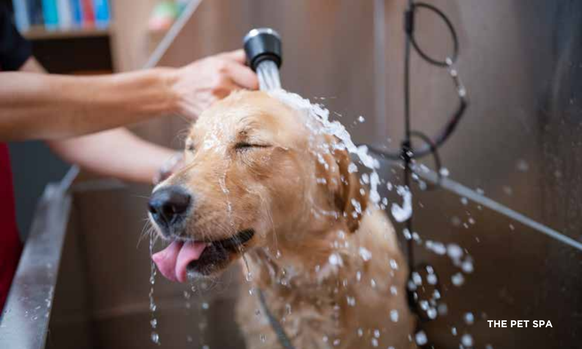
THE PET SPA