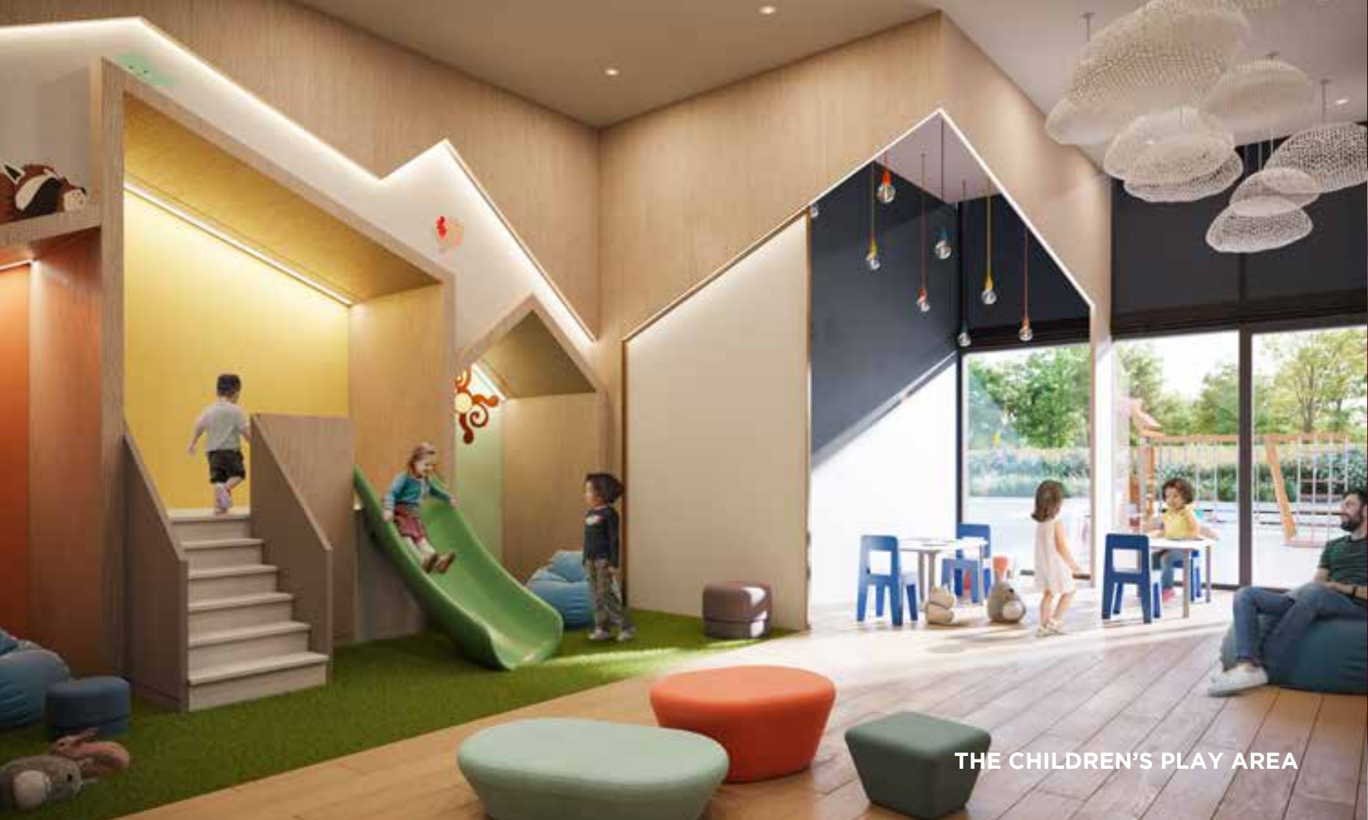
THE CHILDREN'S PLAY AREA