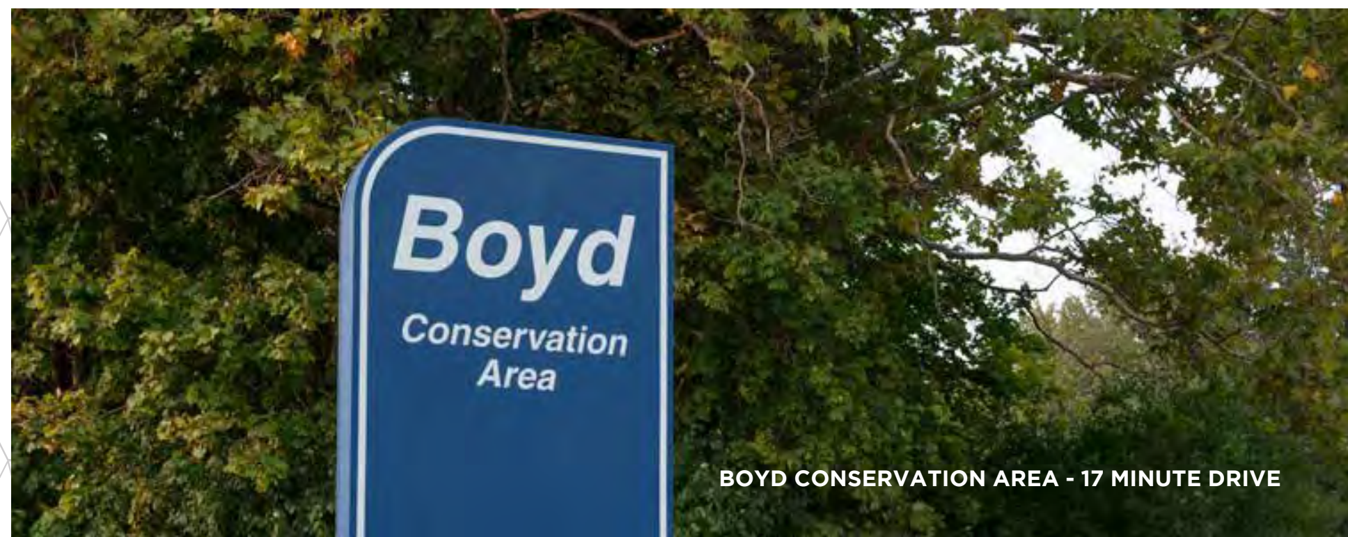
BOYD CONSERVATION AREA - 17 MINUTE DRIVE