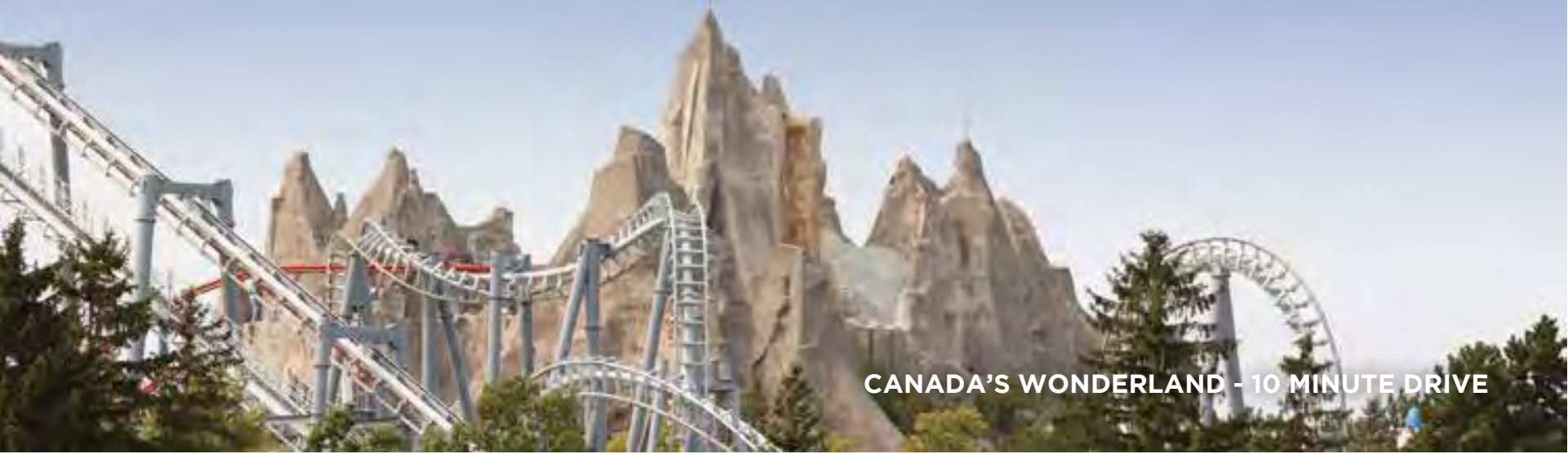
CANADA'S WONDERLAND - 10 MINUTE DRIVE