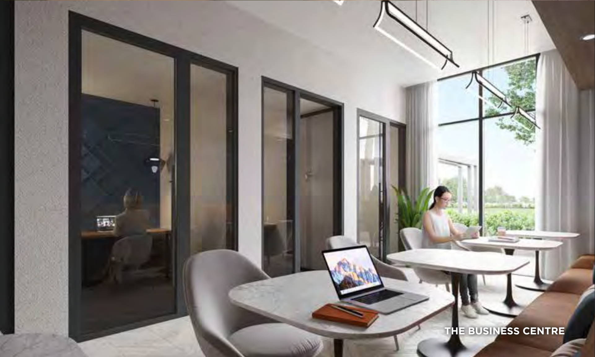
THE BUSINESS CENTRE