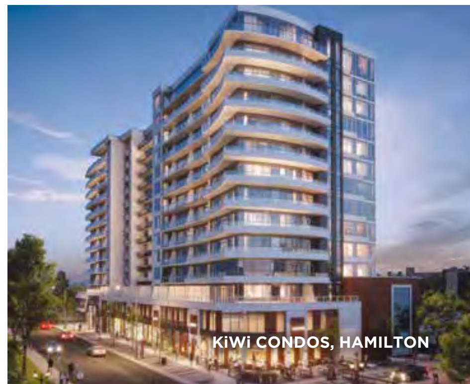
KIWI CONDOS, HAMILTON