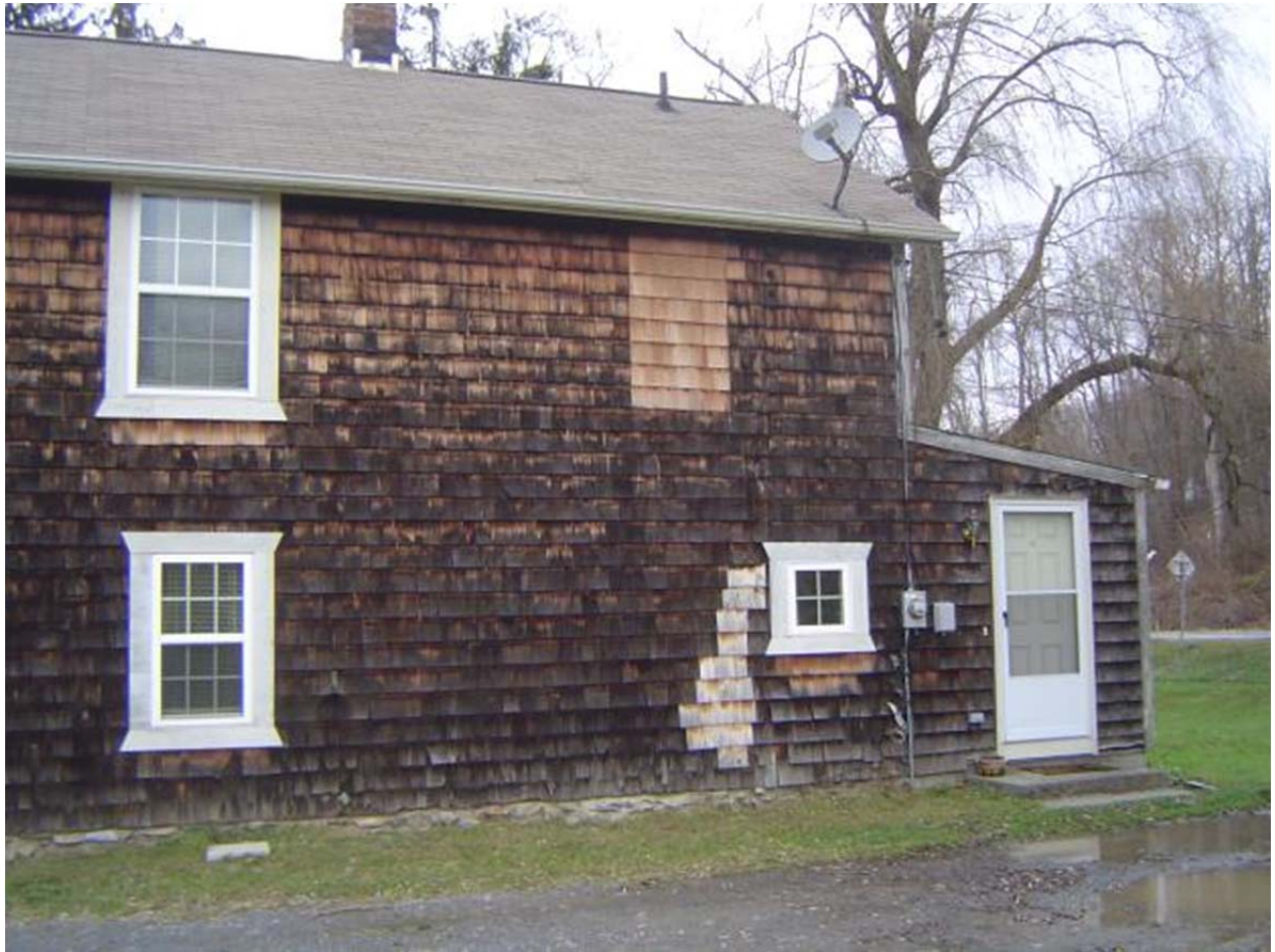
Figure 5 - Left Elevation of Existing House