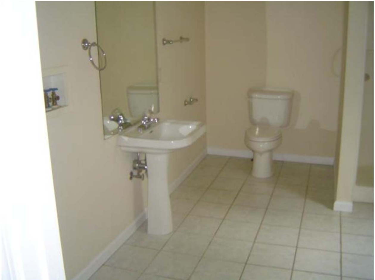
Figure 10 - Bathroom in Existing House