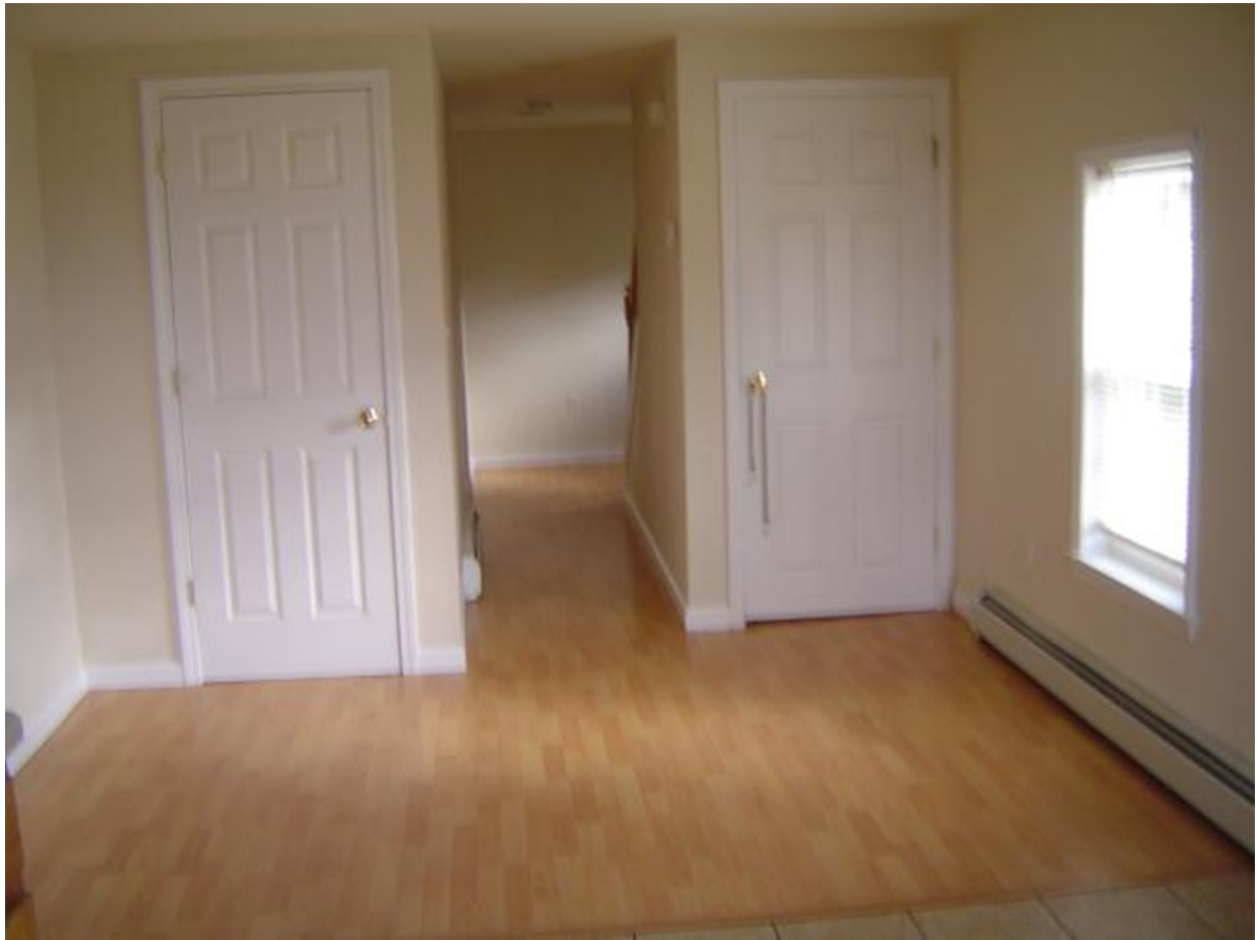
Figure 7 - Dining Room of Existing House