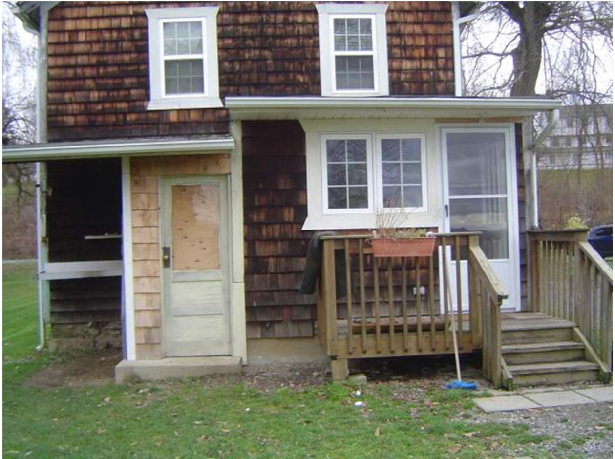
Figure 4 - Rear Elevation of Existing House