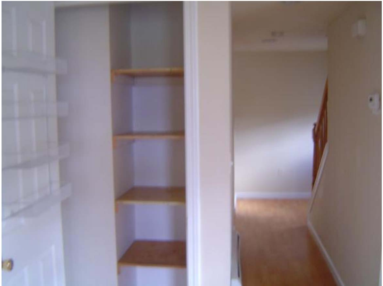
Figure 8 - Interior Hallway of Existing House