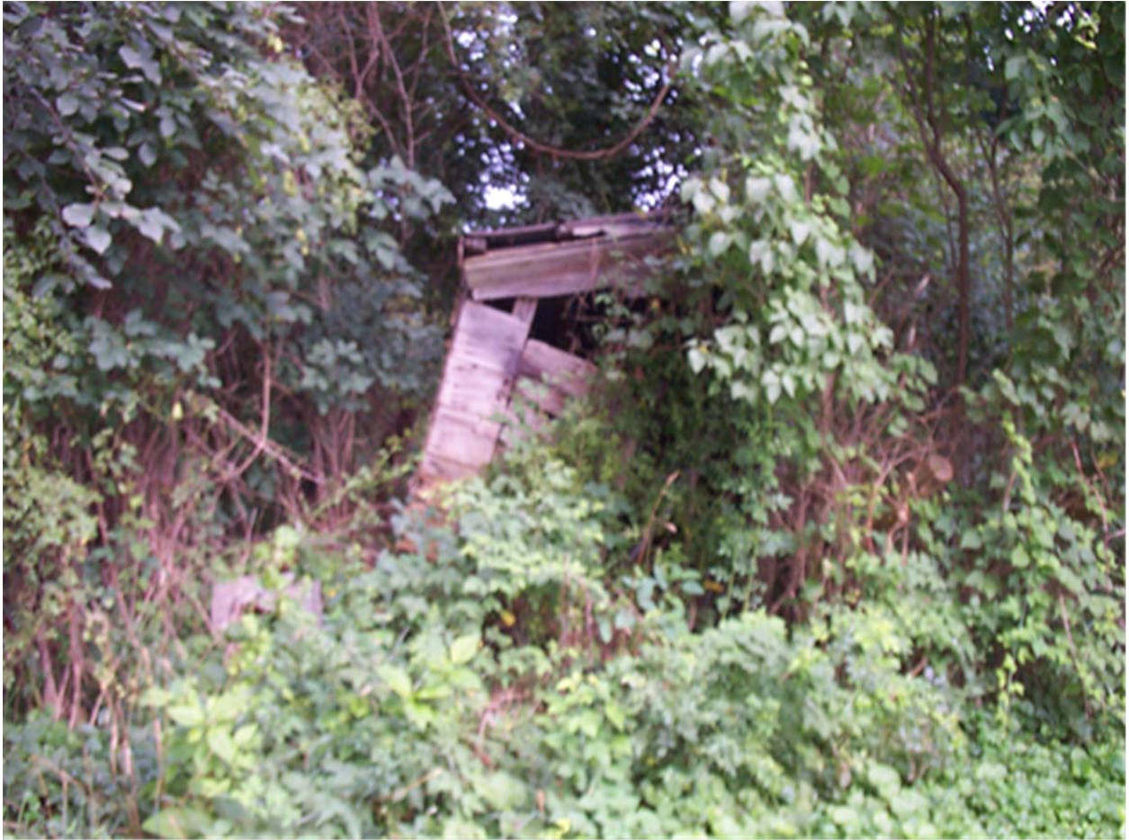
Figure 12 - Existing Corncrib – Demolished (No Longer Exists)