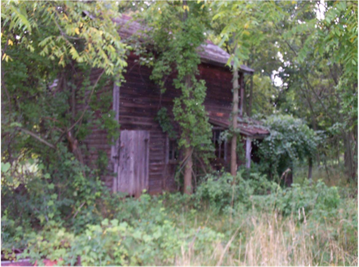
Figure 11 - Existing Barn #1 – Right View