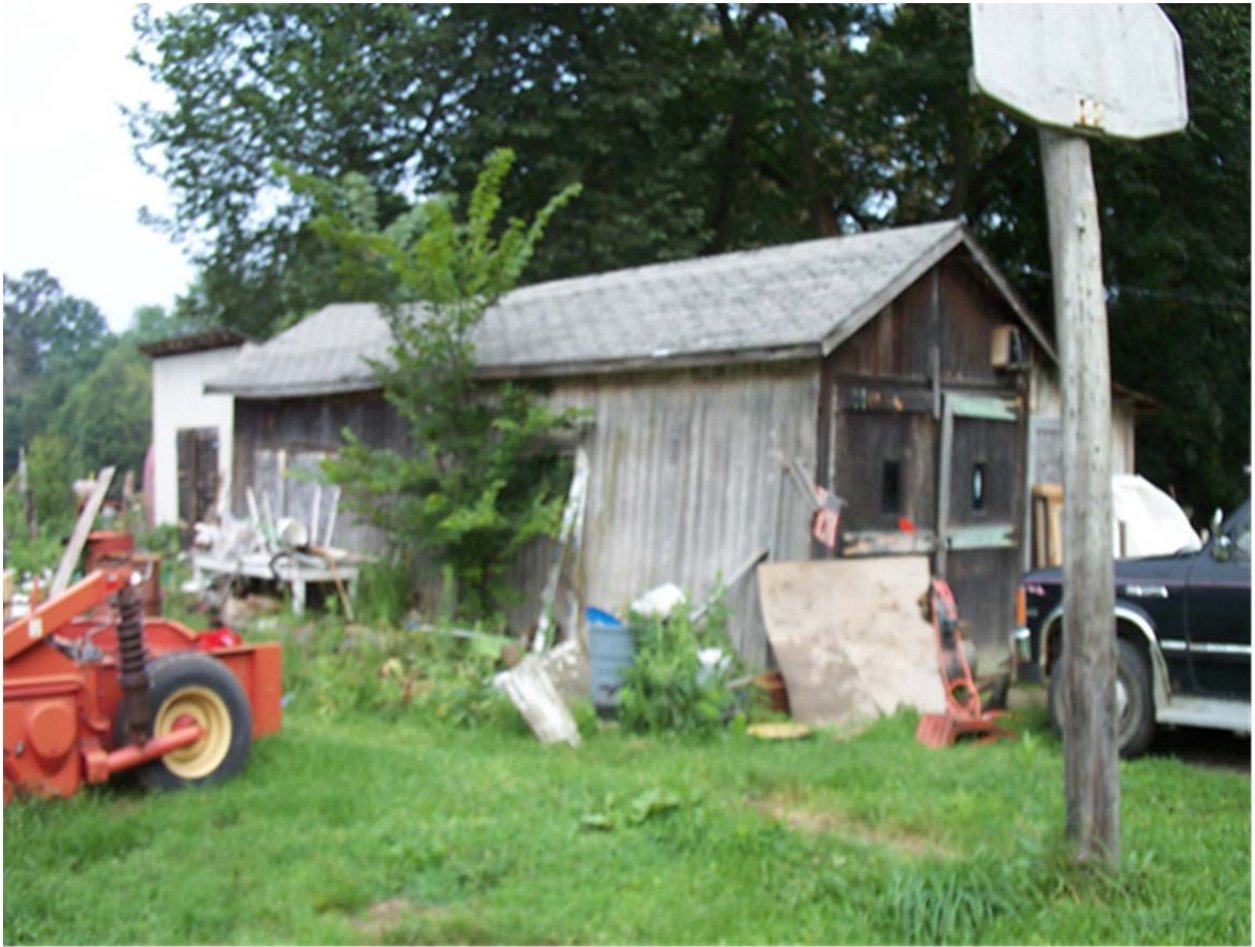
Figure 13 - Existing Garage - Demolished (No Longer Exists)