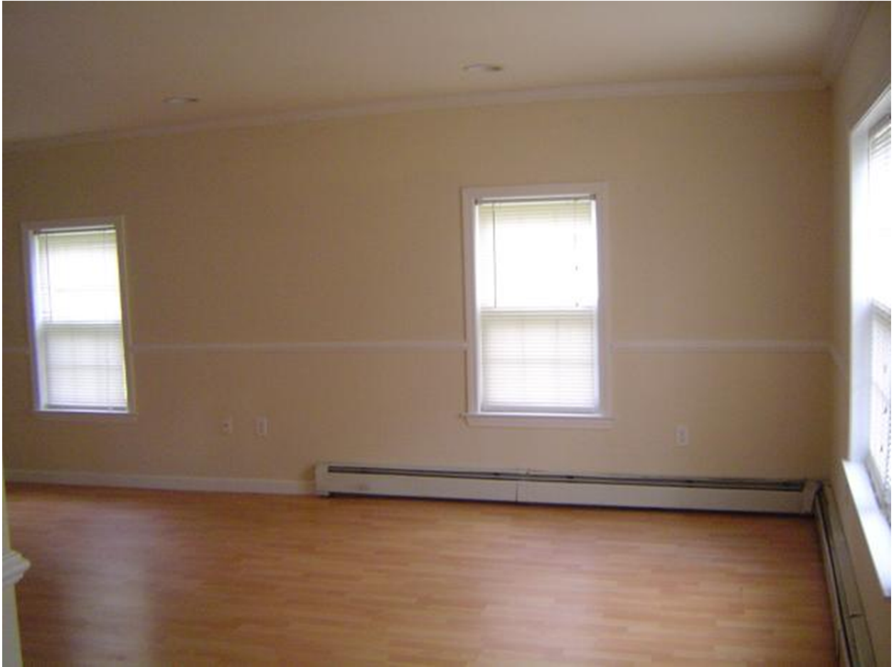
Figure 9 - Master Bedroom in Existing House