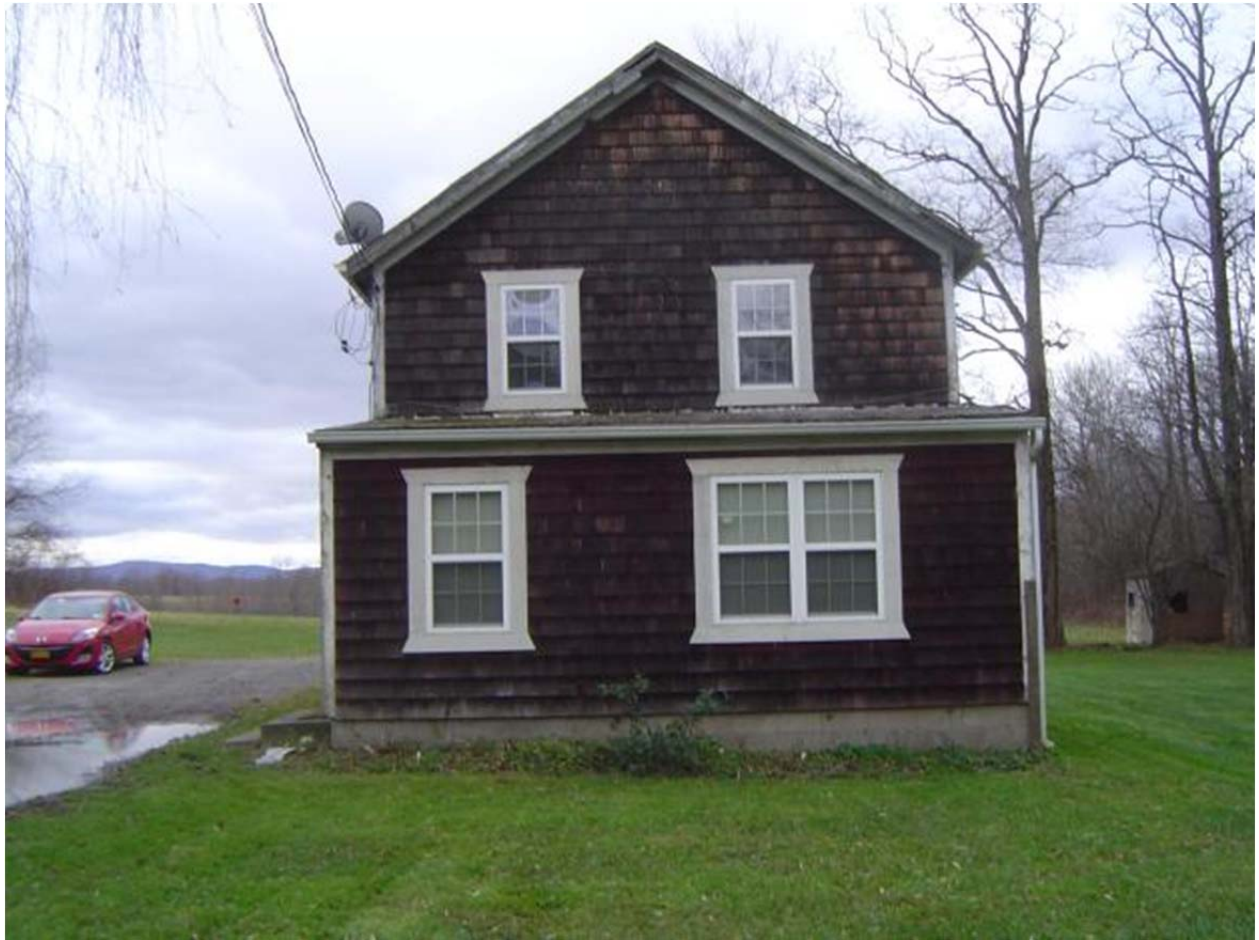
Figure 2 - Front of Existing House