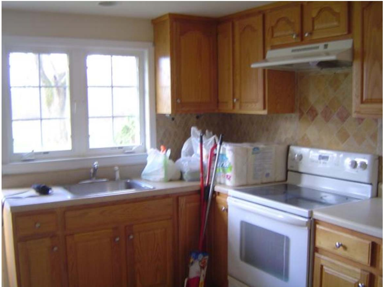
Figure 6 - Kitchen of Existing House