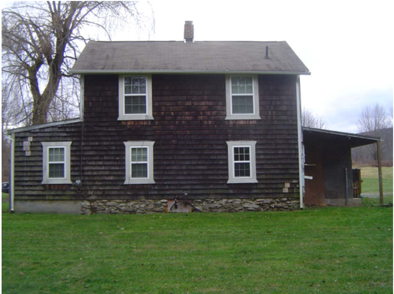
Figure 3 - Right Elevation of Existing House