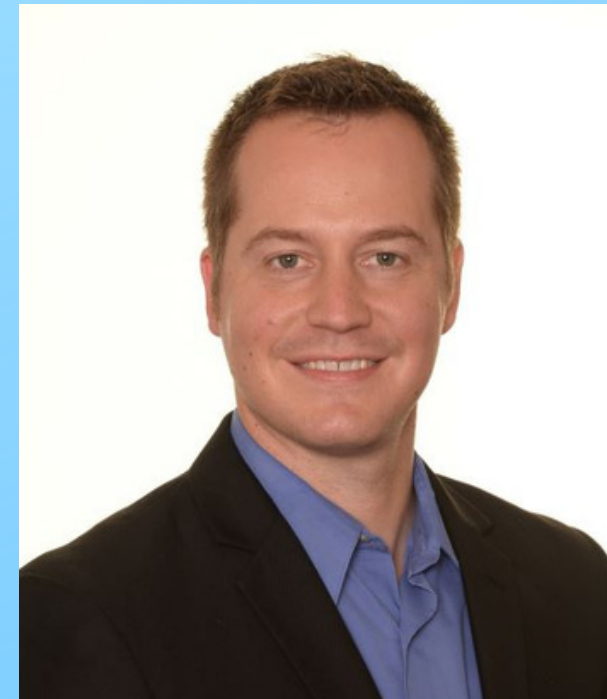
Founder and CEO

We provide high-quality and affordable tutoring – through individual and group tutoring, we personalize lessons to make sure employees are advancing quickly and successfully in their English skills.