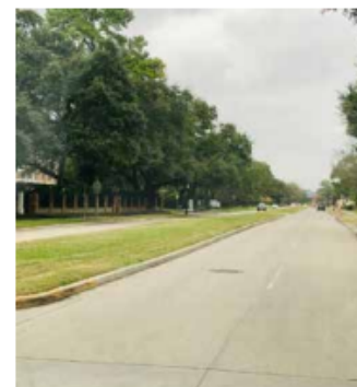
"Before" photo of the boulevard esplanades