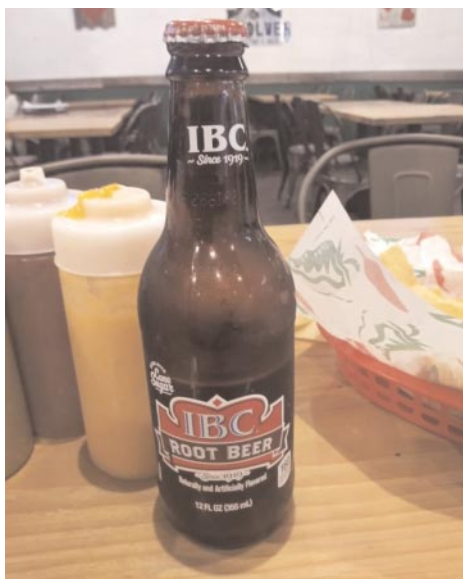
They even have IBC Root Beer

It's just maddening to think that the best Tacos in McKinney are the result of a Taco crush. That's when you are so crazy about Tacos, you open the best Taco paradise in McKinney, Texas. Crazy thought, but there's is nothing else in McKinney, that I have tried, that even compares. The menu spans the global of Taco traditions and offers something for all tastes.