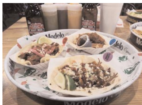
Chicken and Waffles Taco, Brisket Taco and Pastor Taco

The homemade Hot Sauce is available in Mango Habenero, Salsa and Tomatillo and the perfect crowing touch. The Mango Habenero is definately the hottest