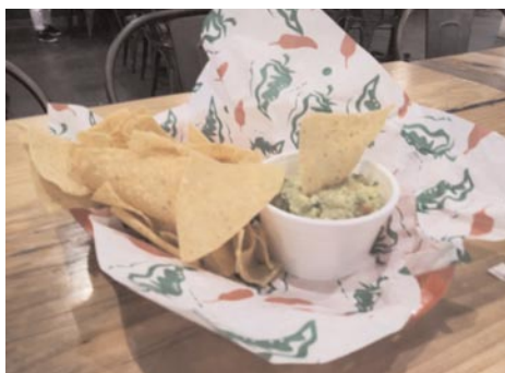
Guacamole served with the Queso starter

At Taco Crush, starters, breakfast Tacos, Salad bowls and Quesadillas, Burritos and Flautas, all share the menu with 16 Tacos and Desserts