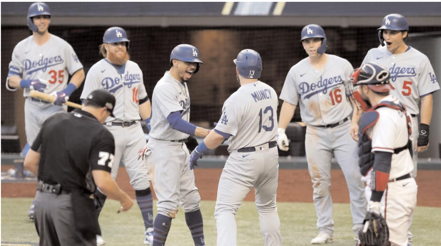
The Dodgers scored 11 runs in the first inning, the most runs in an inning since 1954 when they were the Brooklyn Dodgers