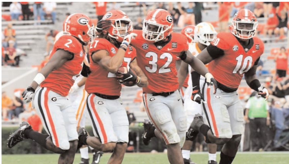
Georgia and Alabama do battle in Tuscaloosa to determine which one makes it to the CFP