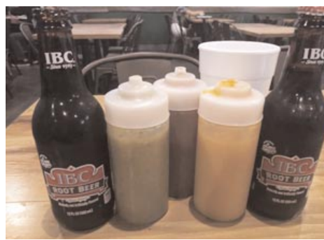
Hot sauce choice are Mango Habenero, Salsa and Tomatillo

Guacamole was extra firm and robustly flavorful. Also available for starters is Refried Beans, Black Beans, Rice, and Chips and Salsa.