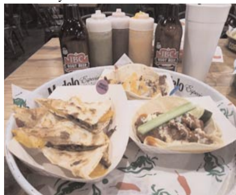
The Ruben Taco

A Full Monty Burrito puts everything a breakfast eater could crave in a huge carrying case. Eggs, Sausage, Bacon, Potatoes, Beans, Mushrooms, Tomatoes and Cheese ....basically the kitchen sink.