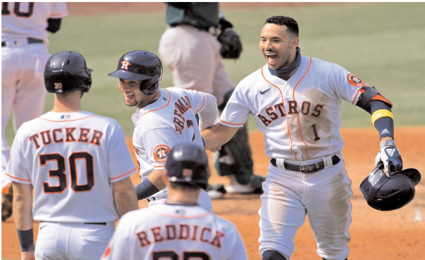
Houston has rallied with a pair of wins to force a game six Friday in San Diego