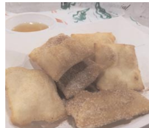
The sopapillas are fantastic

problem is how to eat them all! It willobviously take multiple visits as there are 16 Tacos to choose from!