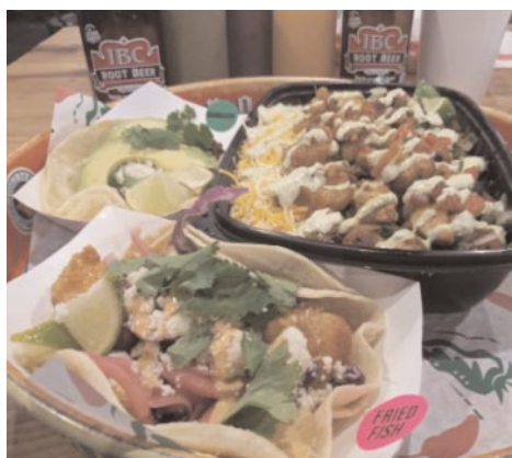
Grilled Chicken Salad Bowl, grilled Fish and Barbacoa

There were no complains about the Beef Quasadillas or the Buffalo Chicken Tacos either. Both scored big in competitive taste.