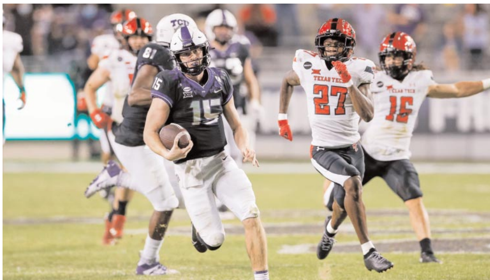
TCU hopes to end its two game losing streak this weekend in Lubbock