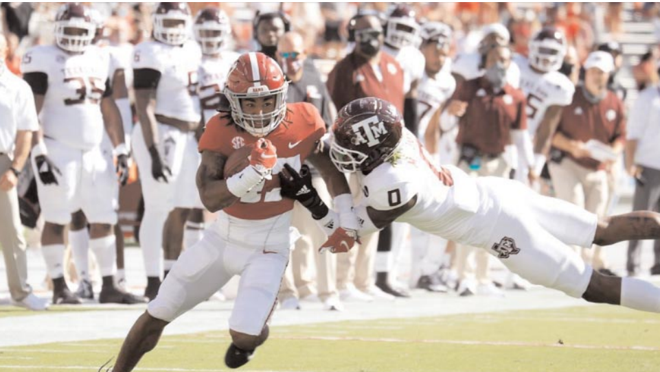
Texas A&M is riding a two game losing streak after climbing to a #5 AP ranking. The Aggies host #1 Alabama this week