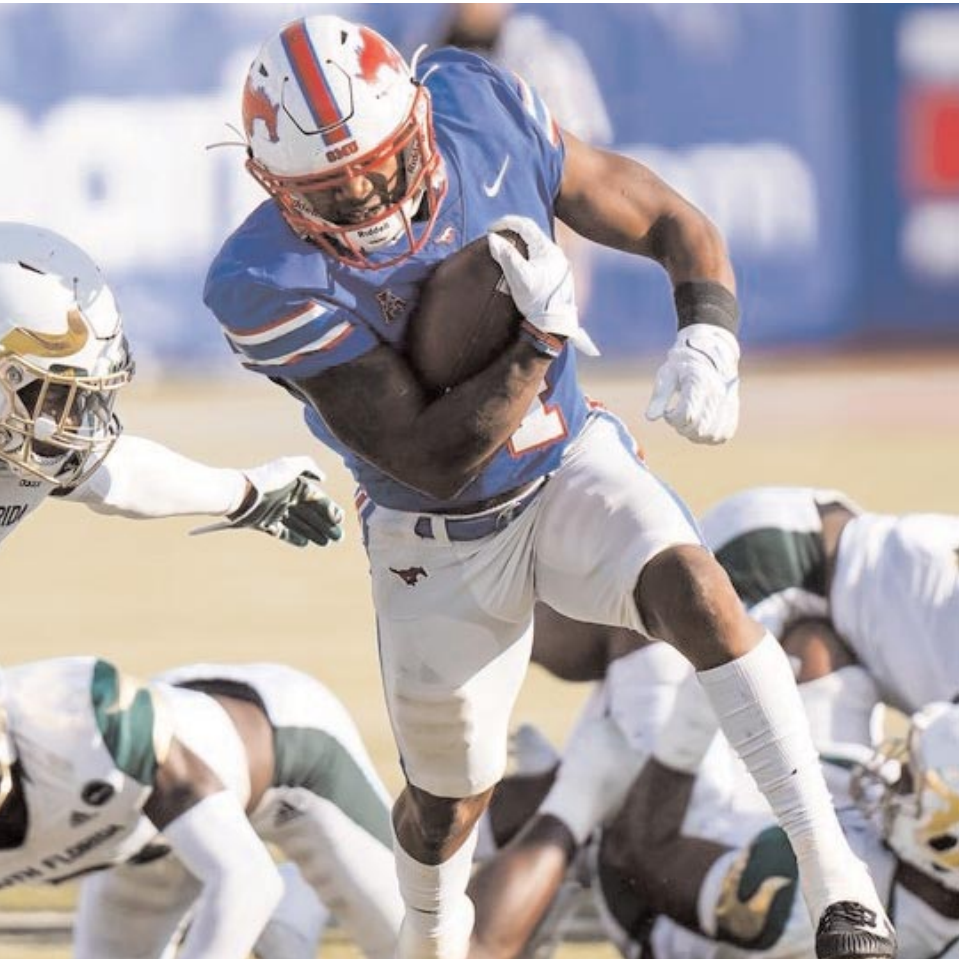
SMU aims to stay undefeated this week at Navy

#24 SMU (5-0) at Navy (1-3) Time / TV: 2:30 / CBSSN Line: SMU -13.5 / 56