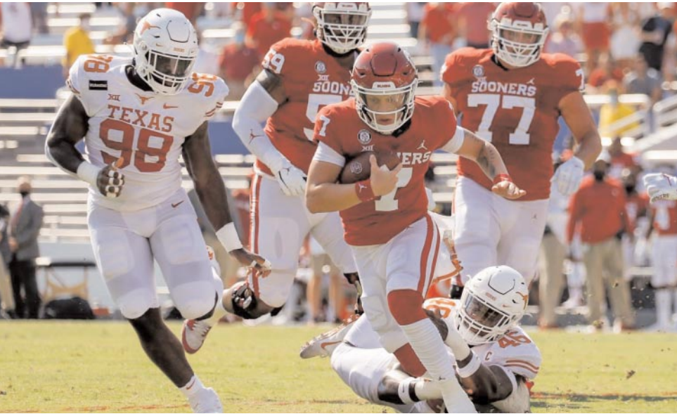
Oklahoma has won the last three contests

#6 Oklahoma (5-0) vs #21 Texas (4-1) Time / TV: 11:00am / ABC Line: Oklahoma -3.5 / 63.5