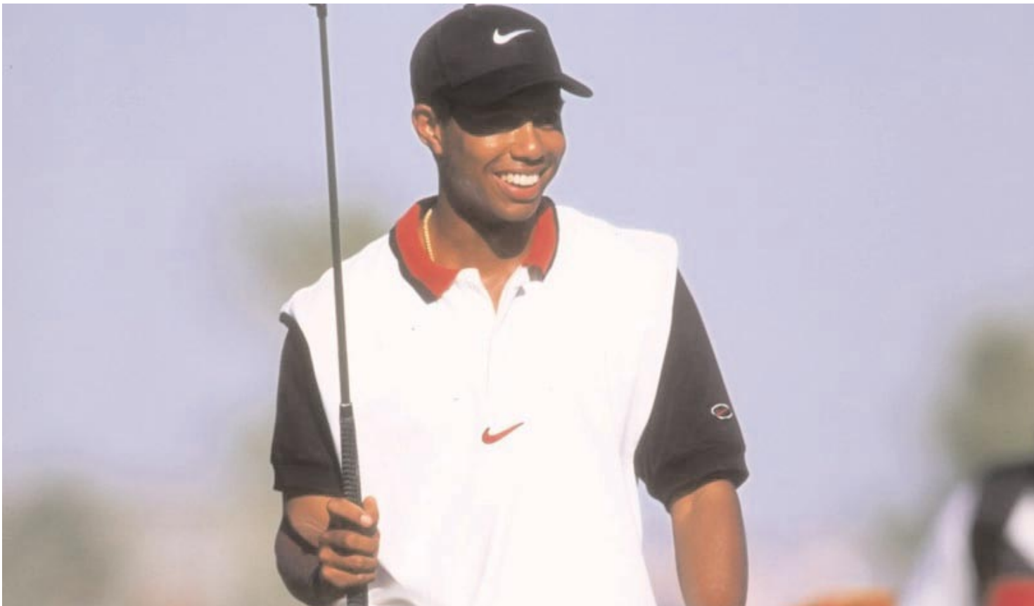
Woods earned the first of his record-tying 82 victories in Las Vegas