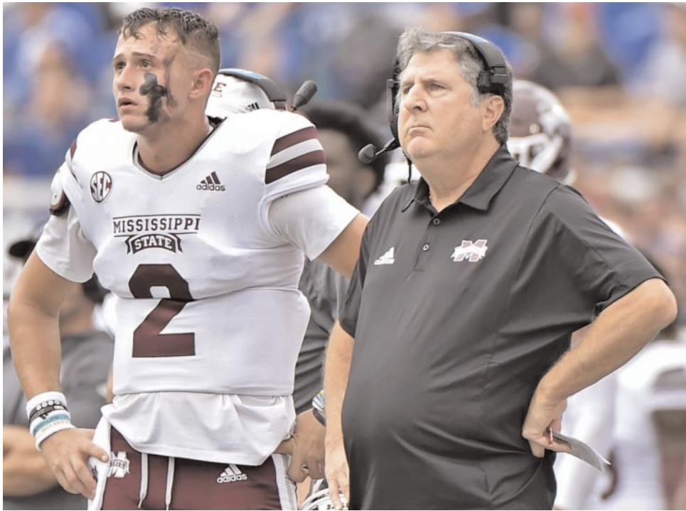
Mississippi State head coach Mike Leach is now 8-3 against Texas A&M as head coach at Texas Tech and MSU