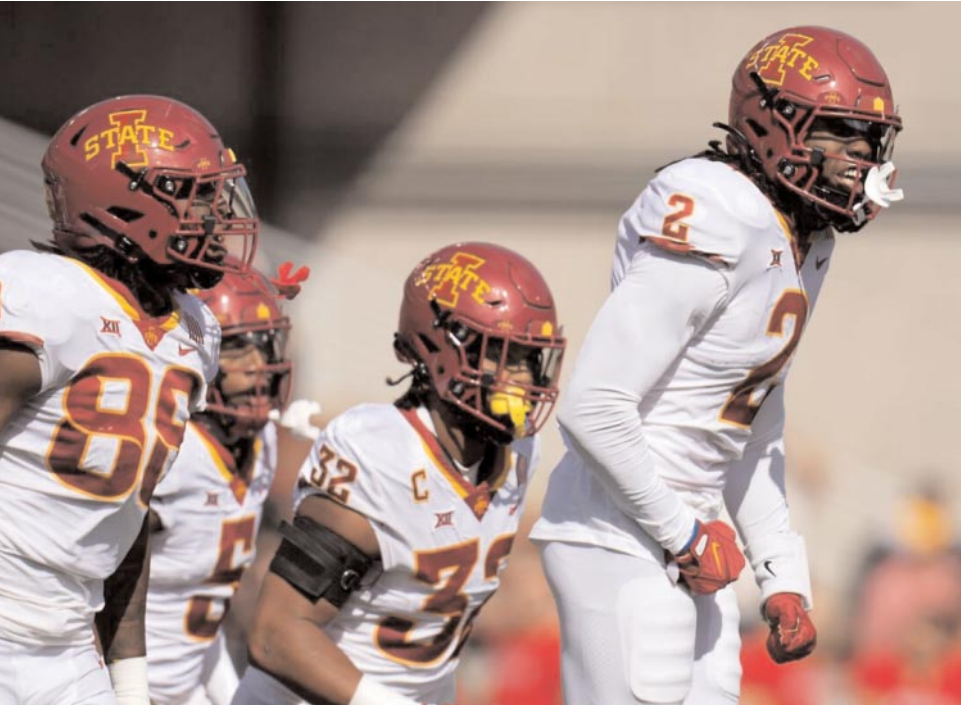
Iowa State has won three of the last four games against Texas at home in Ames