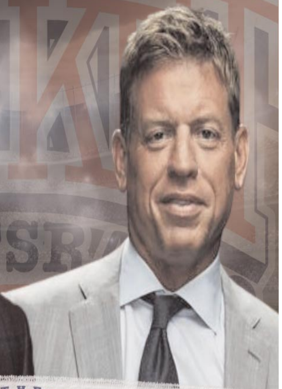
TROY AIKMAN THURSDAY AT 7:55 AM