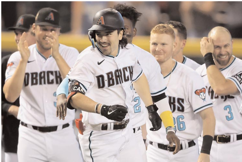
Corbin Carroll and Gunnar Henderson contributed considerably to the rise in relevance of their teams