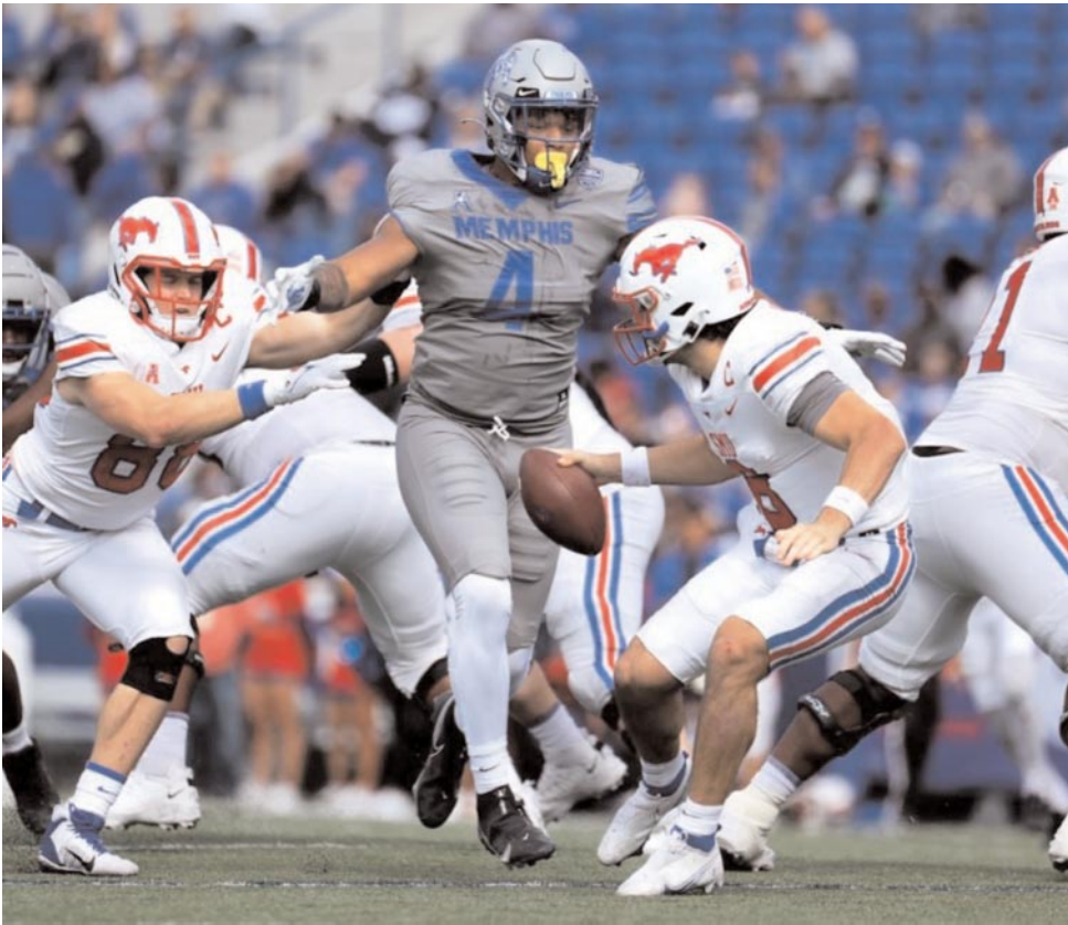
This should be the Mustangs' most challenging game this week against Memphis