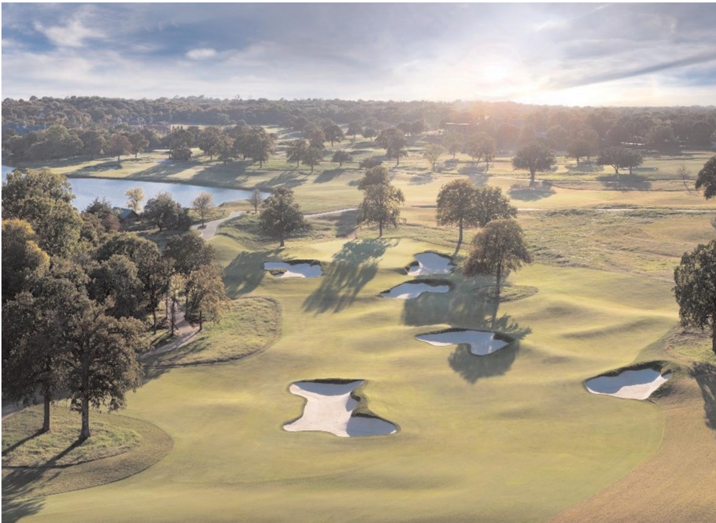
Vaquero's redesign incorporates its unique landforms, including a majestic hill on the front nine that offers unparalleled vistas of the surrounding area