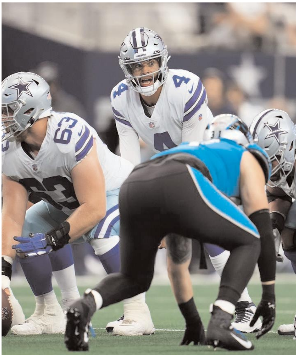
The week the Cowboys have big advantages on both sides of the football