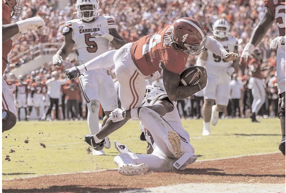
Alabama travels to Norman this week to take on the Sooners