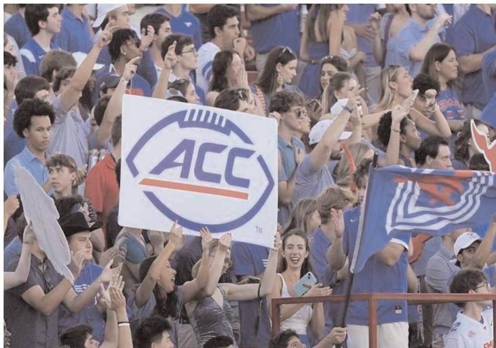
SMU will clinch a spot in the ACC Championship game with a win this week against Virginia