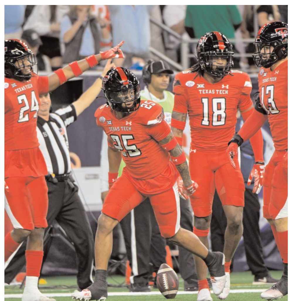
Texas Tech looks to improve its Bowl position with a win in Stillwater Saturday