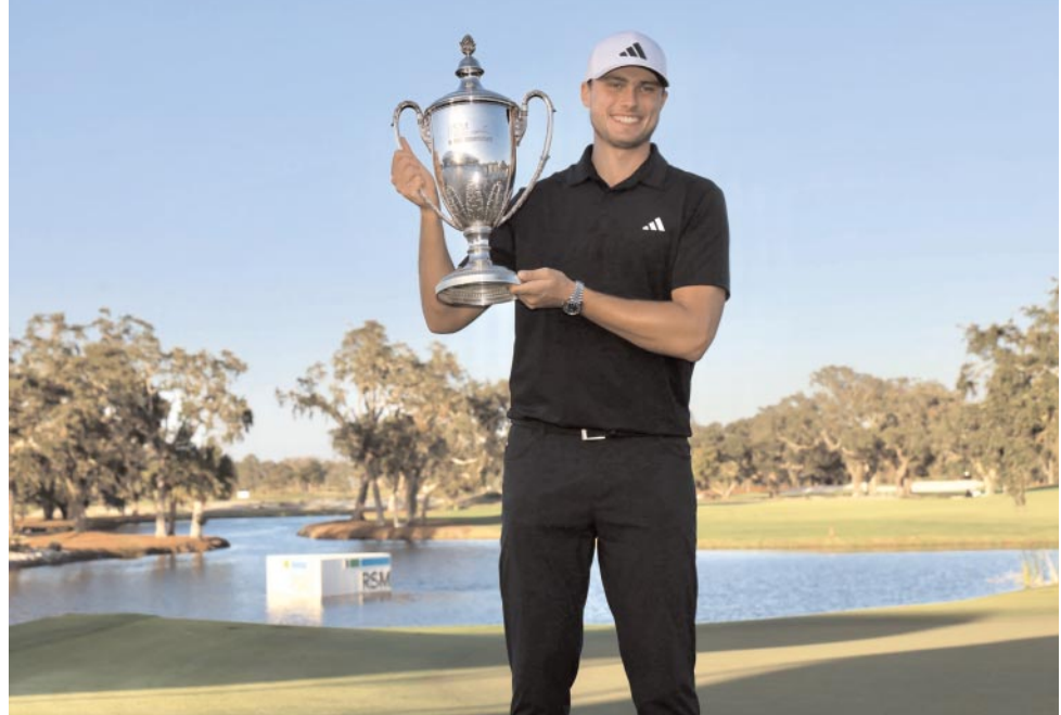
Former Texas Tech golfer Ludwig Aberg returns to defend his title

The RSM Classic November 21 - 24, 2024 Sea Island Golf Club Saint Simons Island Georgia Purse - $8,000,000 Winners share - $1,440,000 Defending Champ - Ludvig Åberg