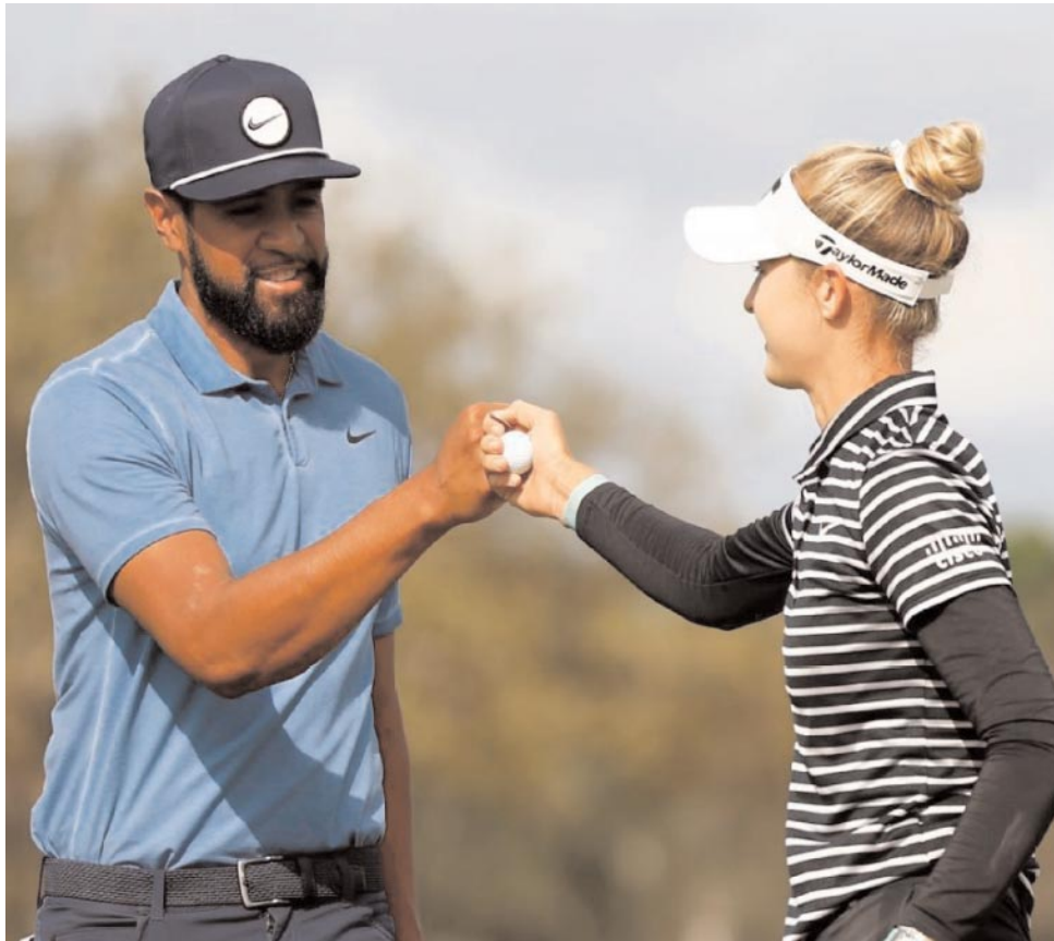
Tony Finau & Nelly Korda walk-and-talk at 2023 Grant Thornton