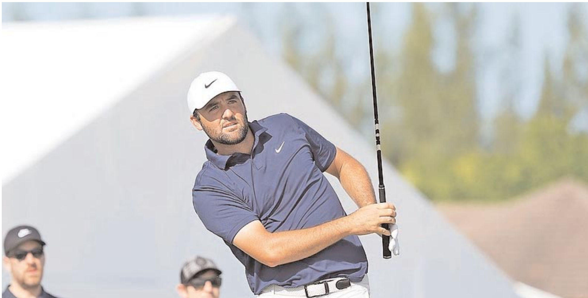
Scheffler won seven PGA TOUR events in 2024, the gold medal at the 2024 Paris Olympics and the season-long FedExCup title

FedExCup champion Scottie Scheffler named PGA TOUR Player of the Year Receives Jack Nicklaus Award for third straight season