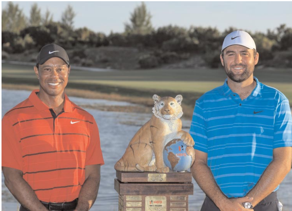
Scheffler has won the Jack Nicklaus Award three years in a row, joining Tiger Woods as the only two golfers to do this