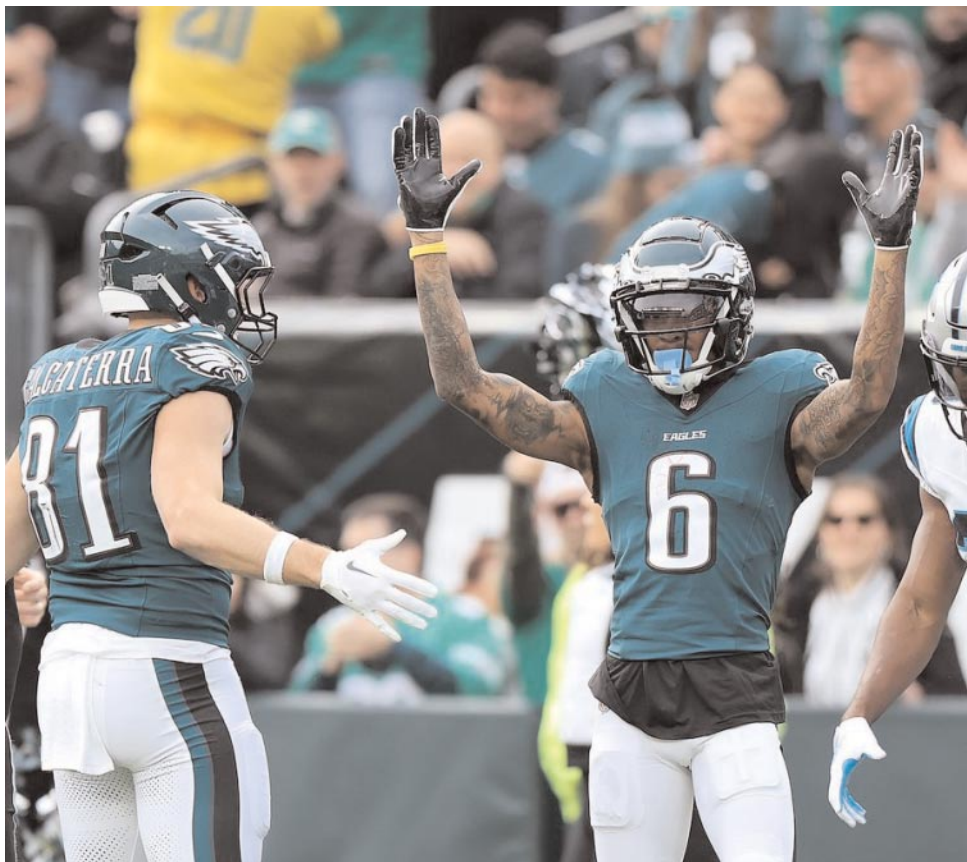
The Eagles are on a nine-game winning streak

Eagles top Steelers, Lions take down Bills in potential Super Bowl previews