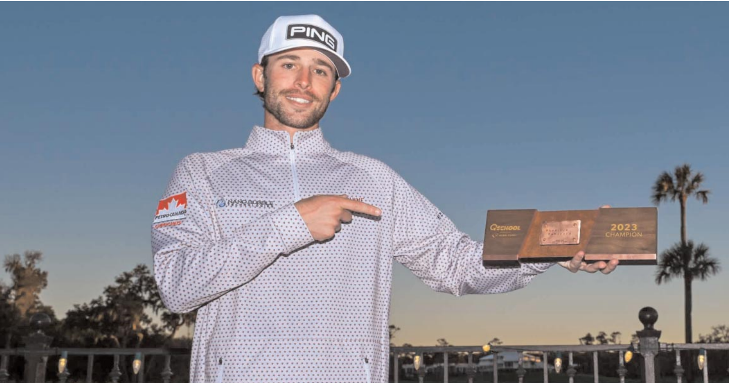
The PGA TOUR Q-School finale is this weekend and PGA TOUR cards are once again on the line

Final Stage of PGA TOUR Q-School December 12 - 15, 2024 TPC Sawgrass and Sawgrass C.C Ponte Vedra, Florida