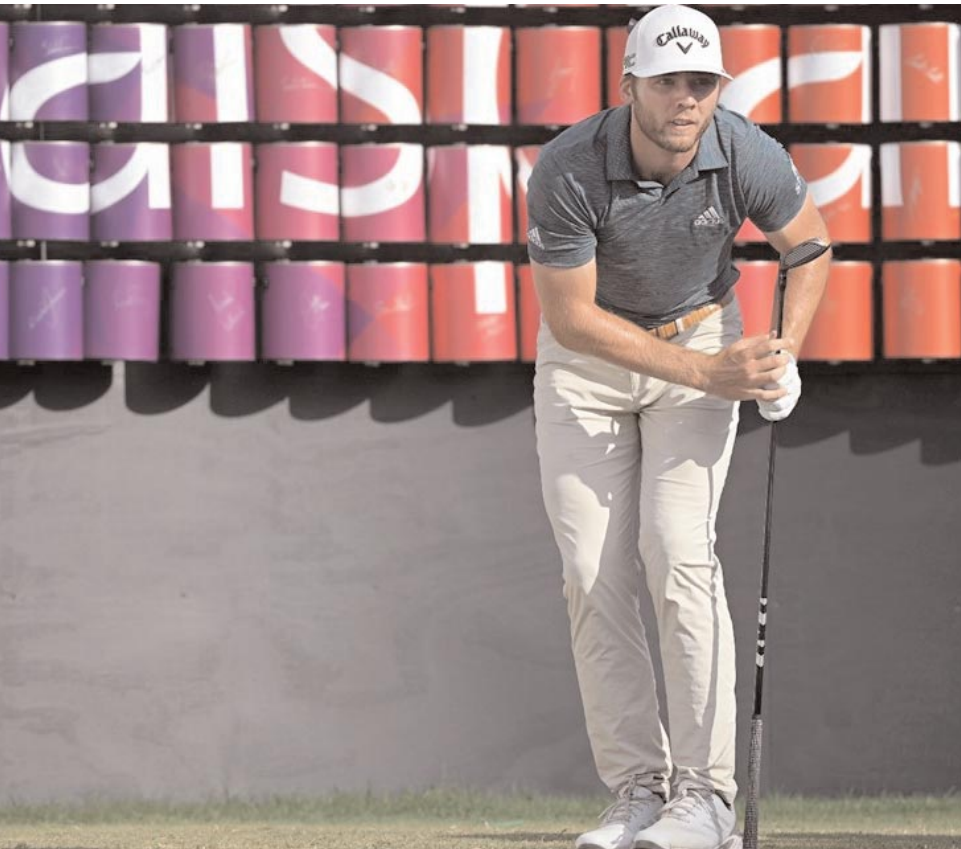
Burns has been inside the top-15 of the Official World Golf Ranking for 52 consecutive weeks