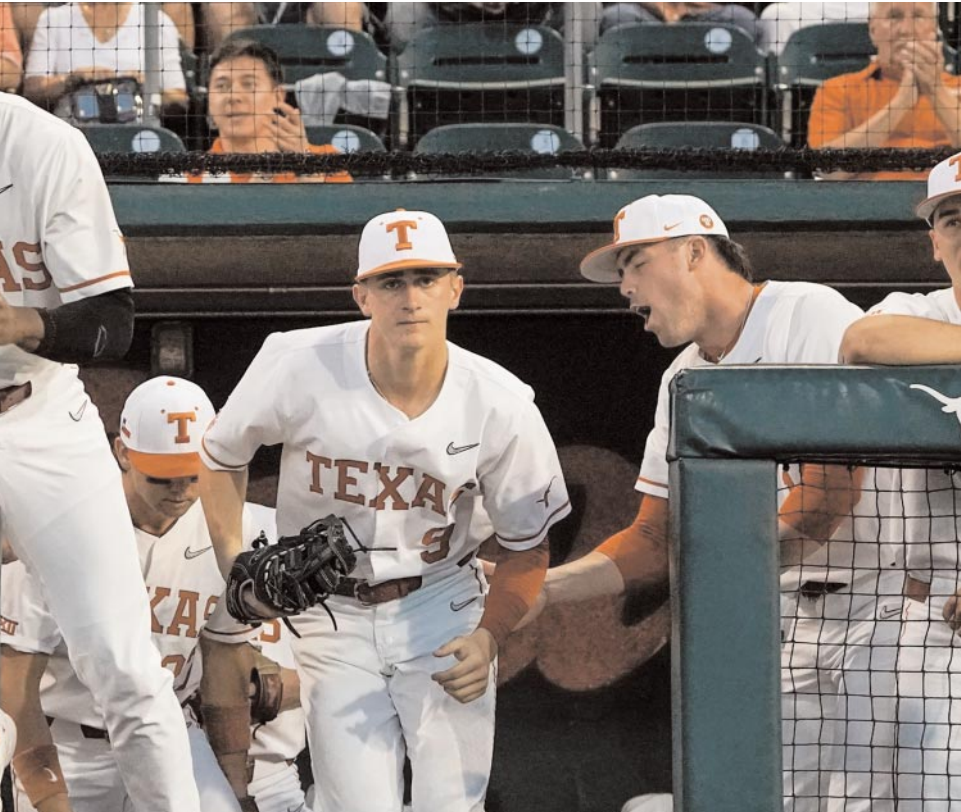
Texas still struggling to get above .500 before conference play starts