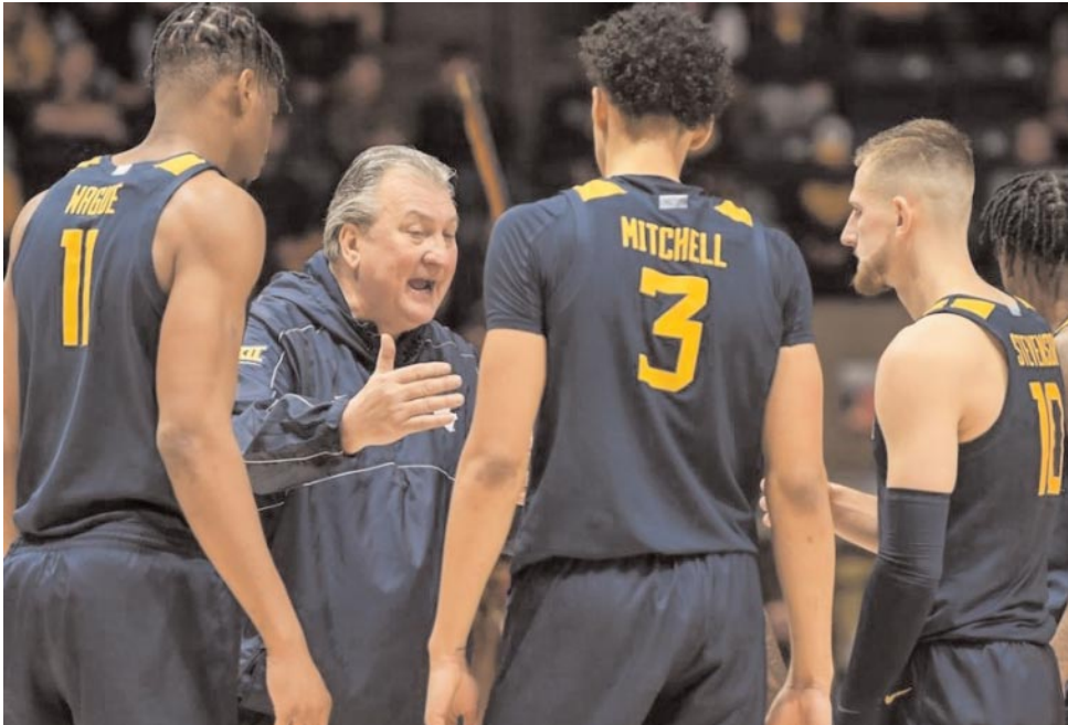
This could very well be Bob Huggins last ride