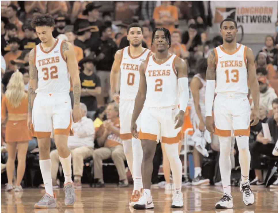
The Longhorns have emerged as one of the favorites to make the Final Four