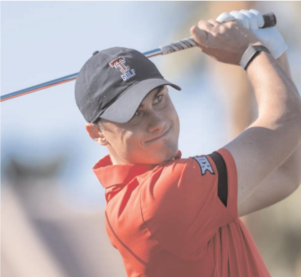
Texas Tech's Ludvig Aberg is ranked No. 1 again this week in both the World Amateur Golf Ranking and the PGA TOUR University Ranking

With less than three months remaining in the college golf season, Texas Tech's Ludvig Aberg retained his No. 1 ranking