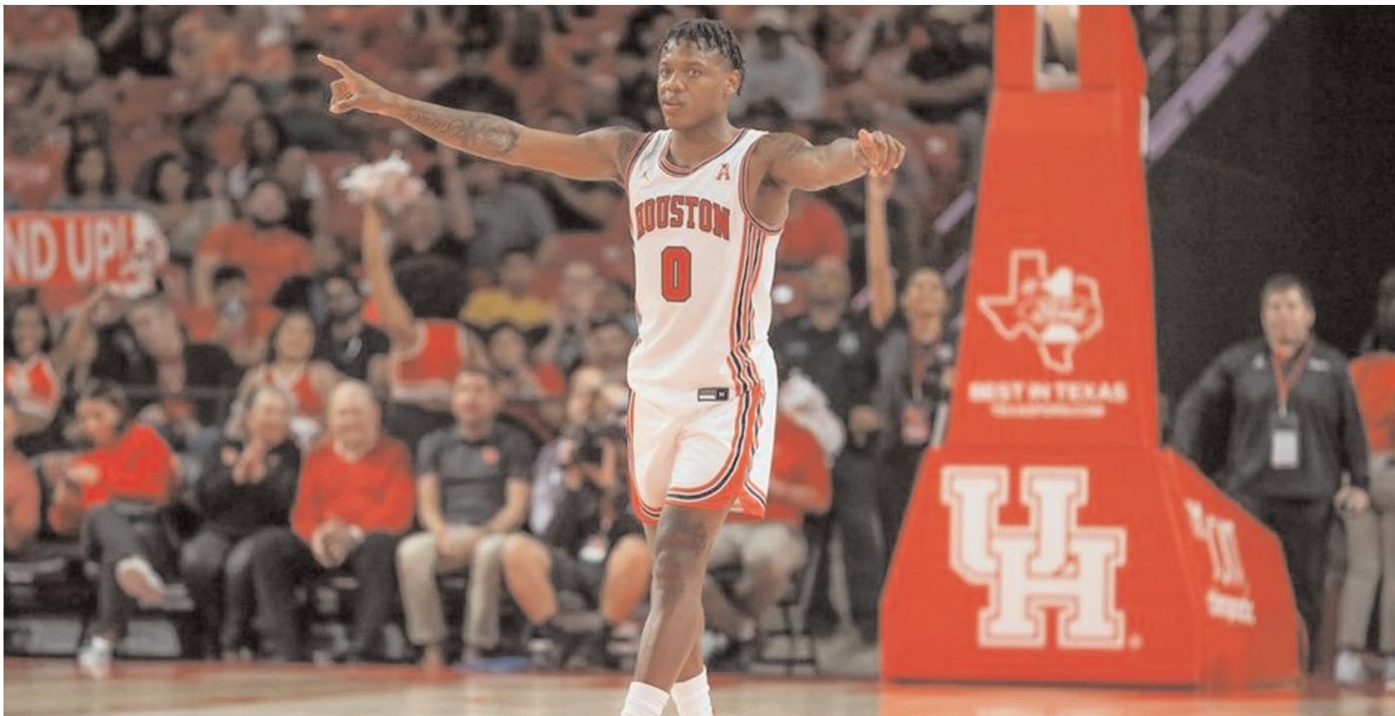
The Houston Cougars enter the NCAA Tournament as the 6-1 betting favorite