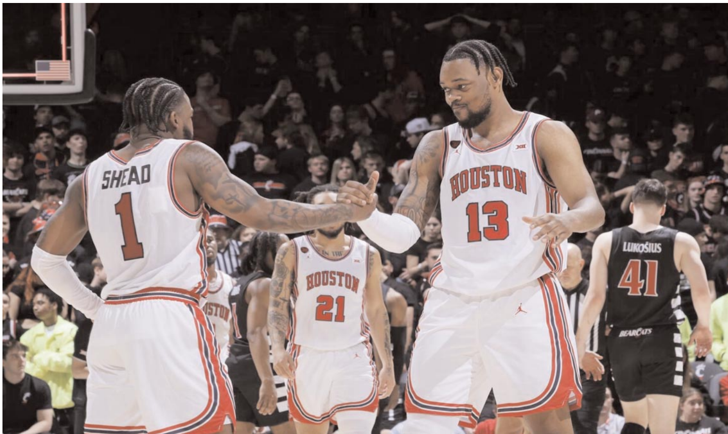
Houston has spent much of the season as the best team in the best conference