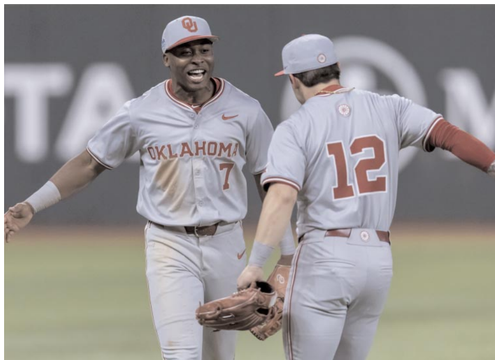
Oklahoma resurfaced as a team to reckon with