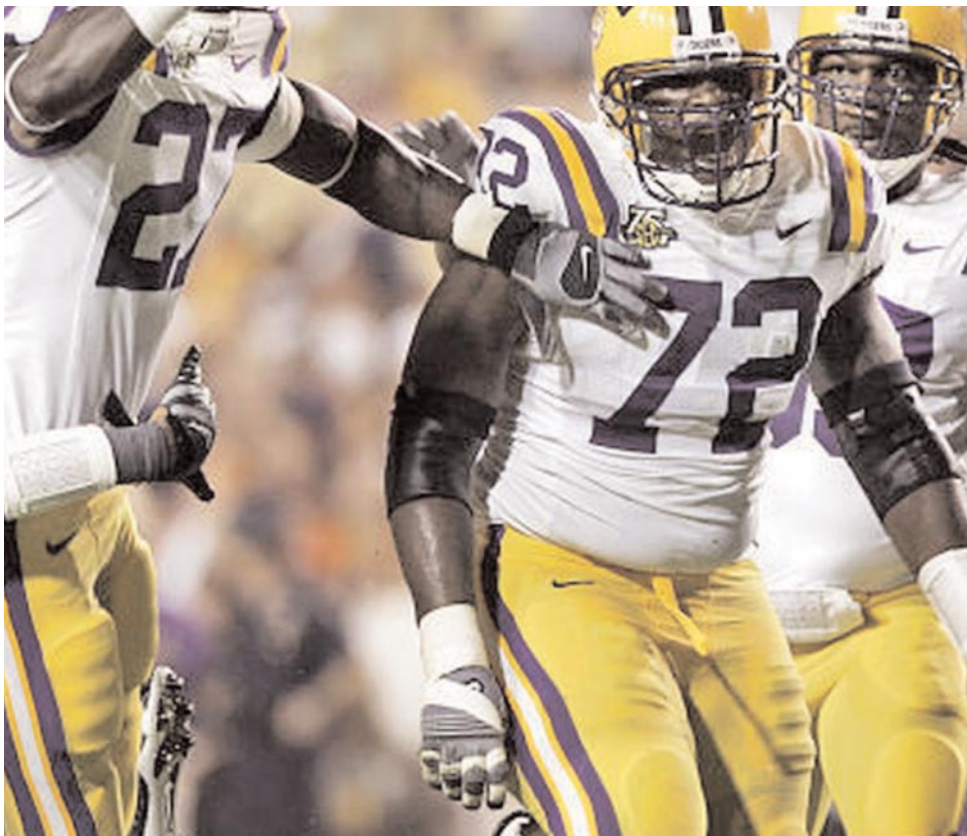
2020 NFF College Hall of Fame inductee Glenn Dorsey of LSU