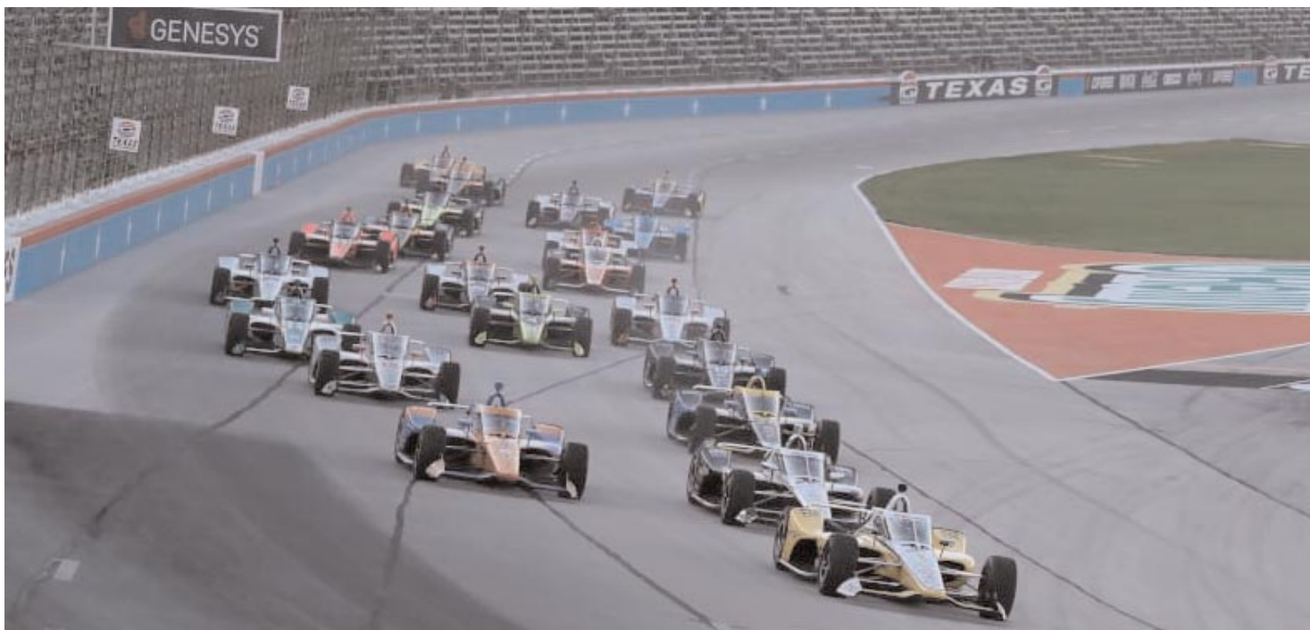
First race of the season is this weekend at Texas Motor Speedway