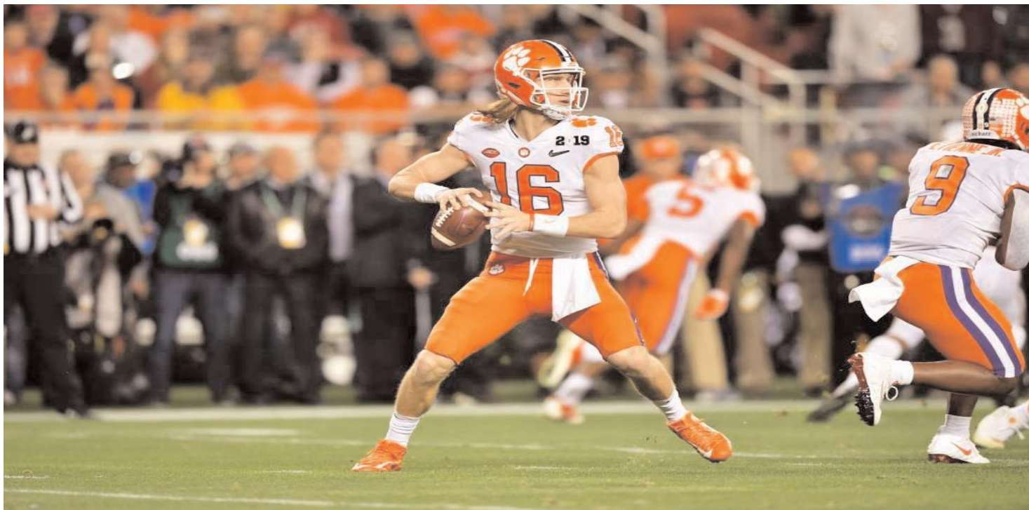
Trevor Lawrence already confirmed he's going to the Jacksonville

In our latest 2021 NFL mock draft, the first 10 picks are from the offensive side of the ball. Five are quarterbacks, largely thanks to blockbuster trades.