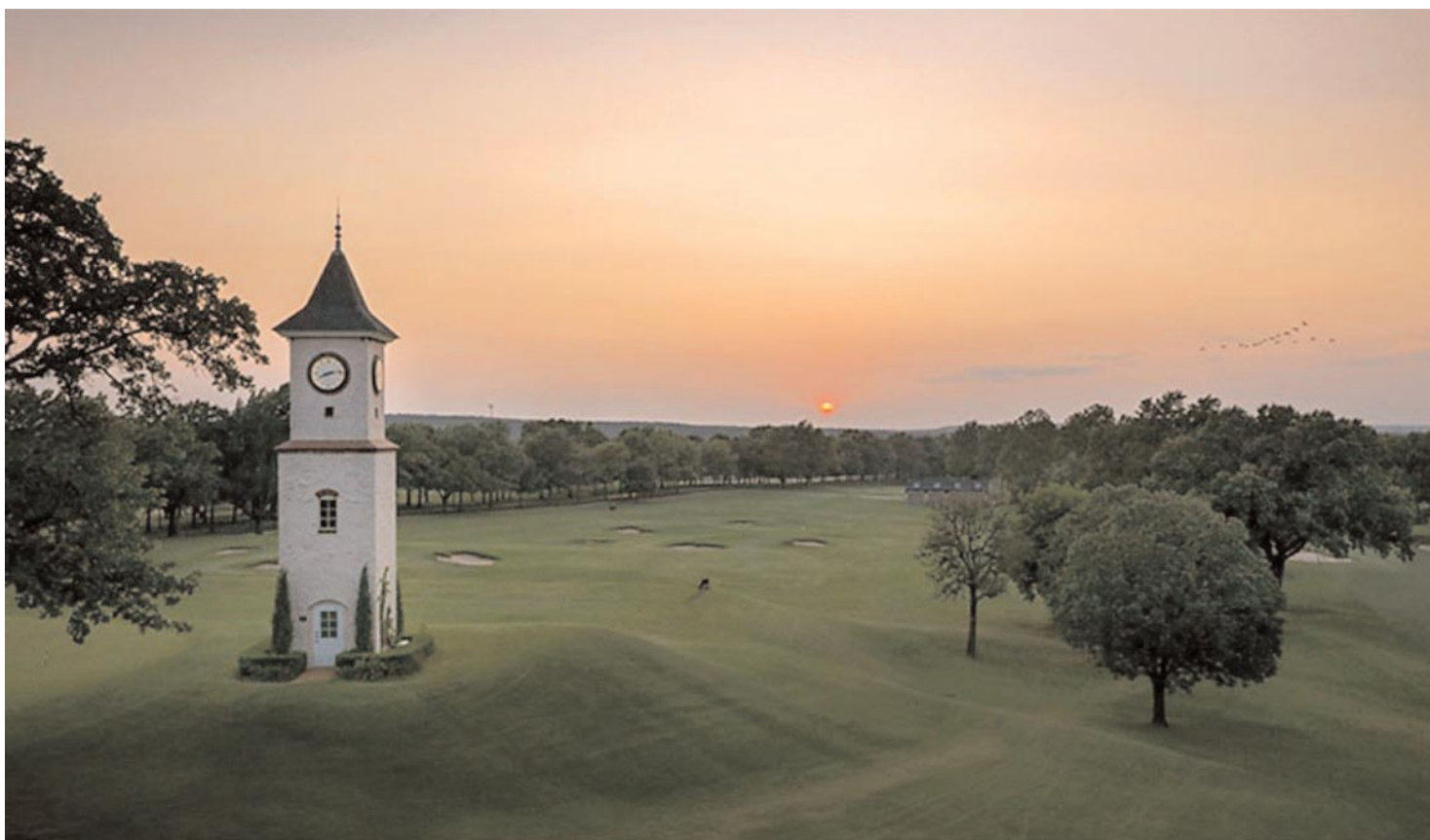
Club will host the 104th PGA Championship.