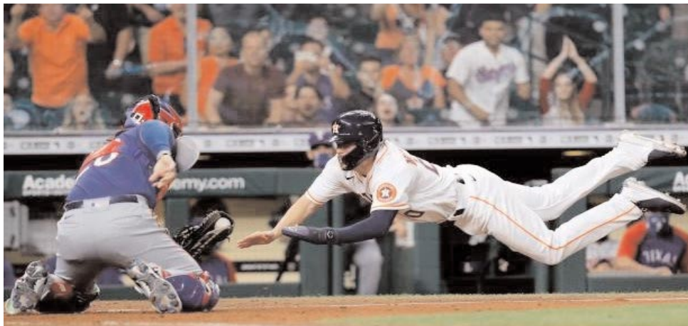
Rangers move into third place in the A.L. West at 17-20