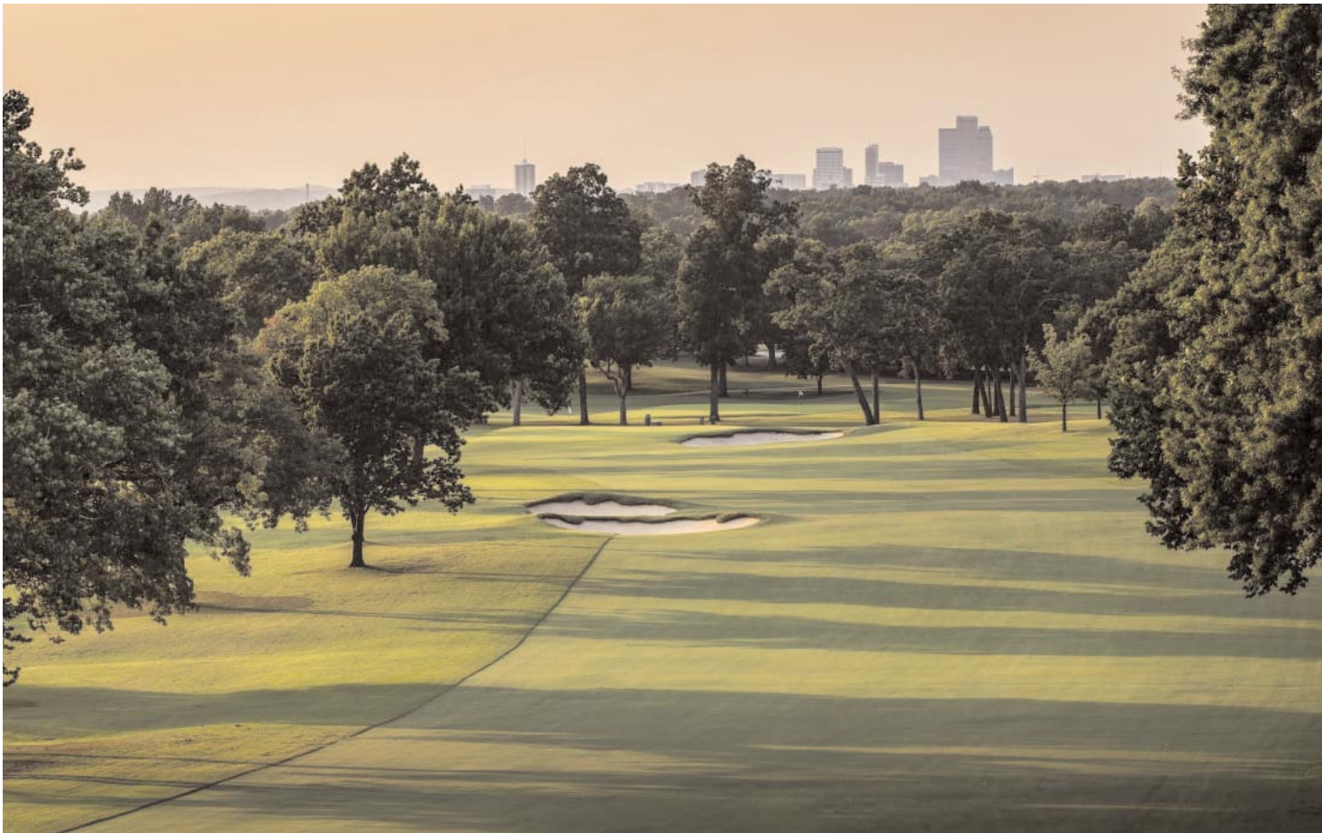
The first hole at Southern Hills is a dogleg left par 4