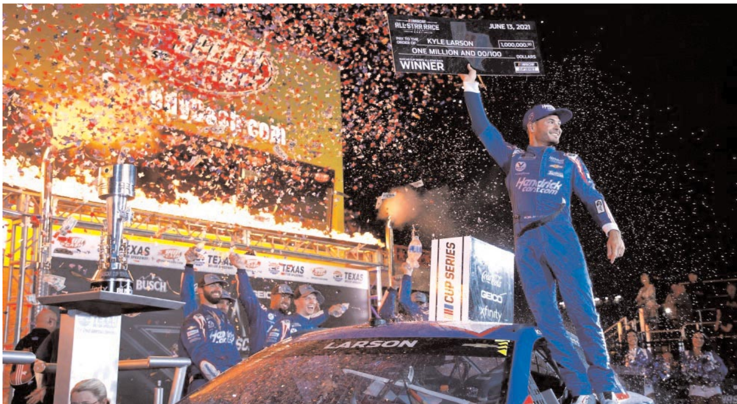
The NASCAR All-Star Race returns to Texas Motor Speedway this weekend for the second consecutive year