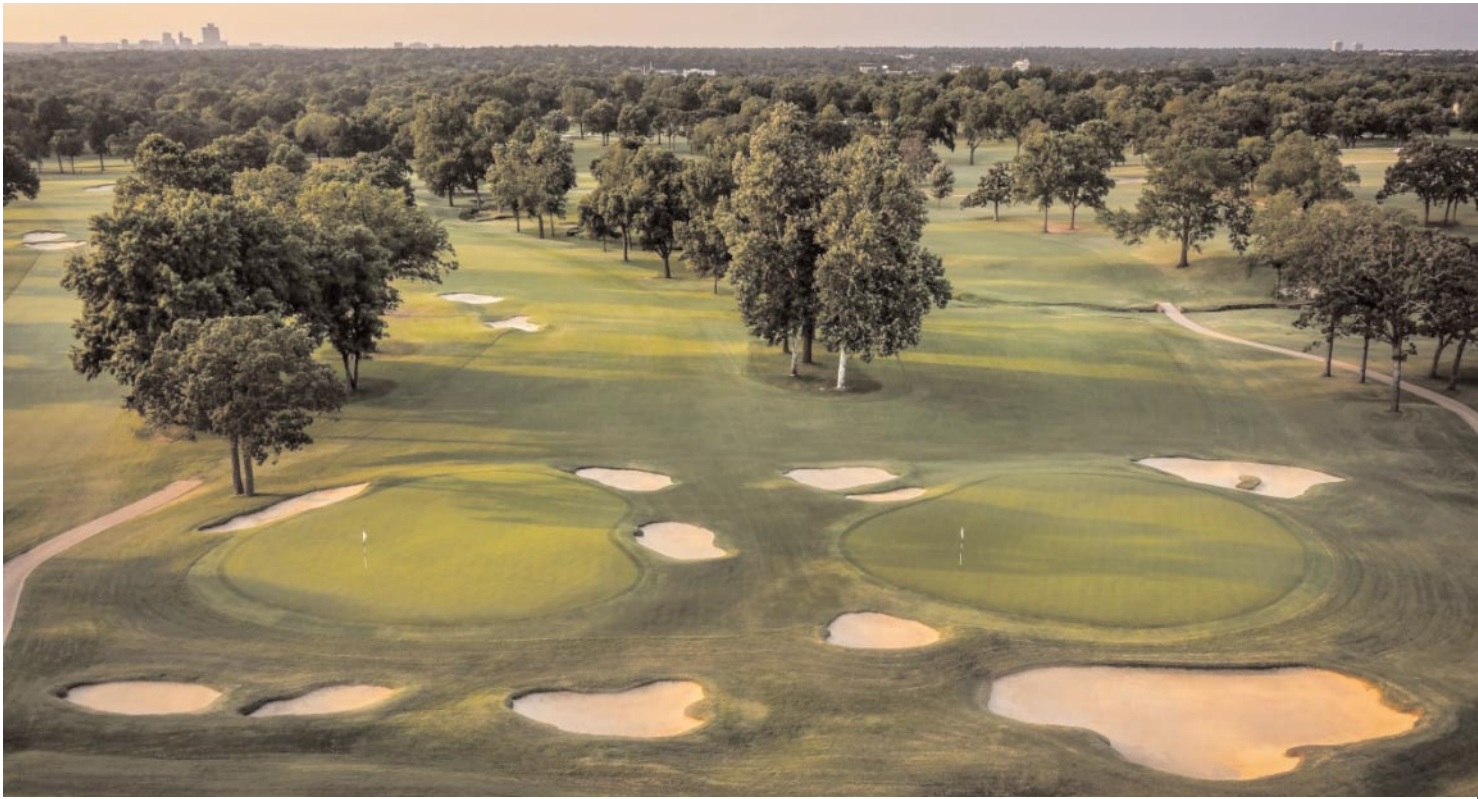
Hole #9 is a 457 Yard par 4. The big decision you have to make is with your layup