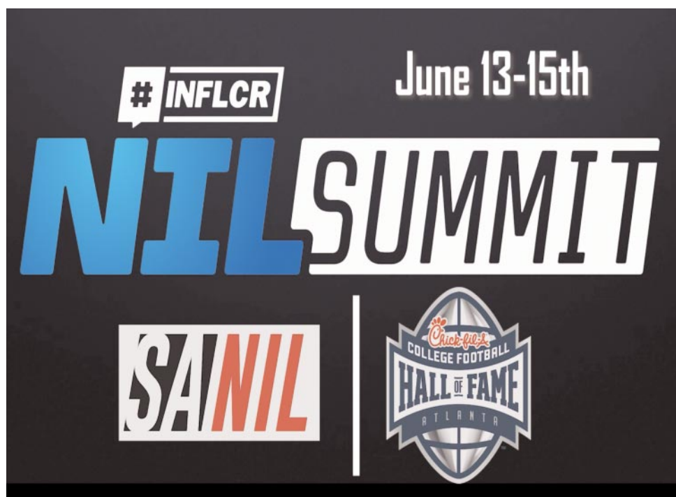
The inaugural NIL Summit will be held in Atlanta