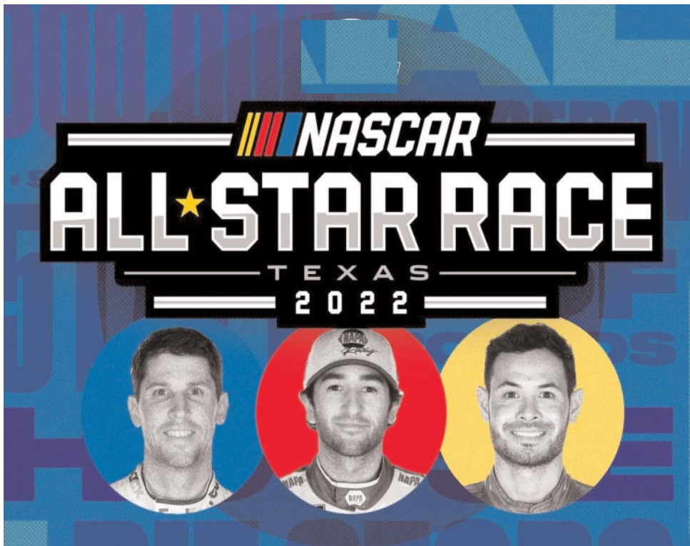
Sixteen drivers will be competing in The Open for three berths in the NASCAR All-Star Race