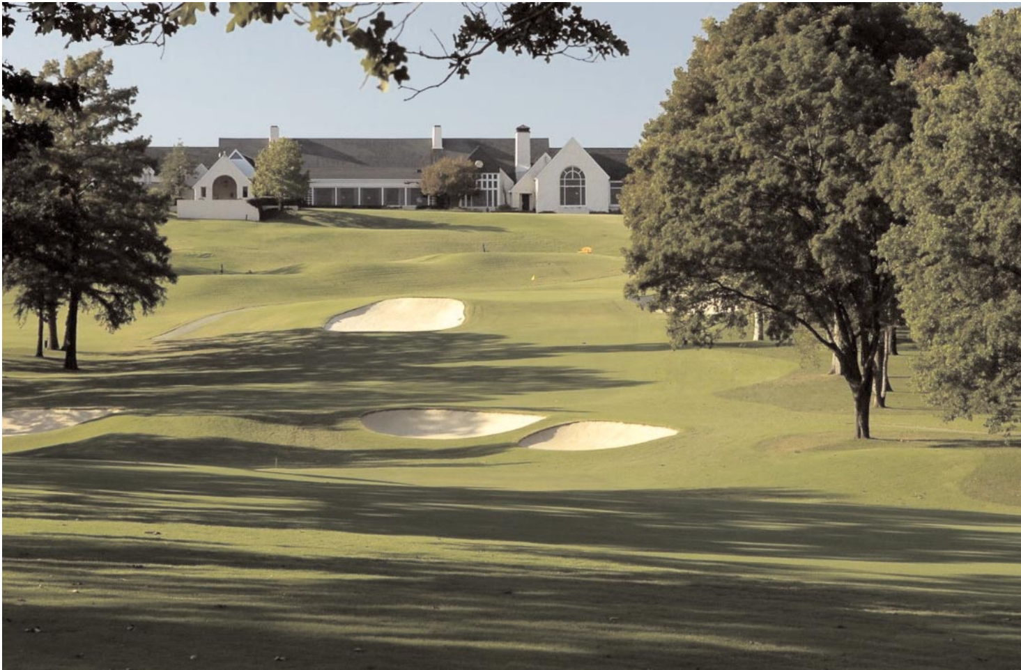
A scenic view of the 18th hole at Southern Hills Country Club.