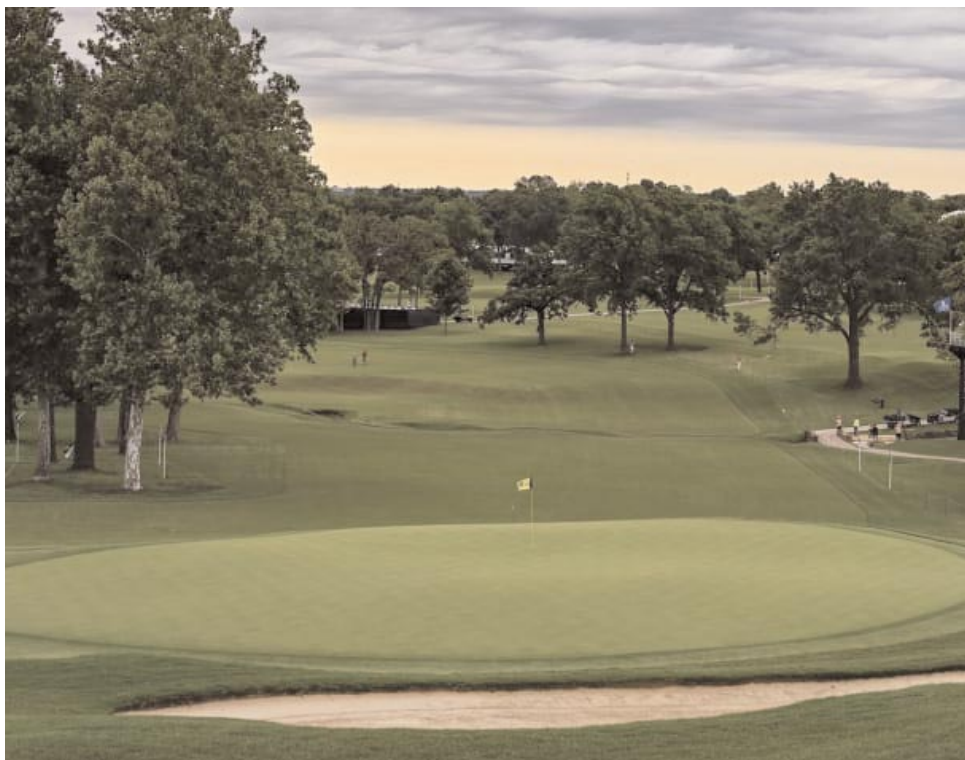
Southern Hills will play host to the 2022 PGA Championship.