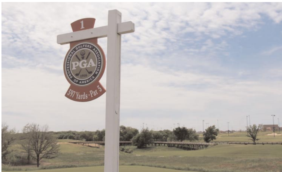
PGA Frisco's highly anticipated debut has finally arrived