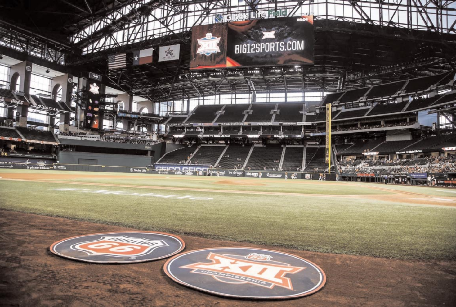
This year's Big 12 Championship should be more competitive than previous years as seven squads have a top-50 RPI