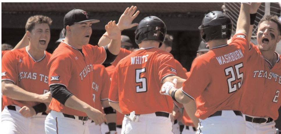
Texas Tech is the dark horse in this year's tournament