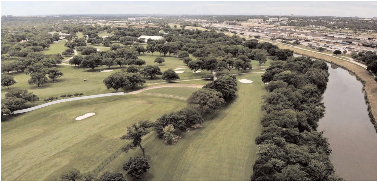
The Horrible Horseshoe, the nickname for holes 3-5, is one of the toughest stretches on TOUR