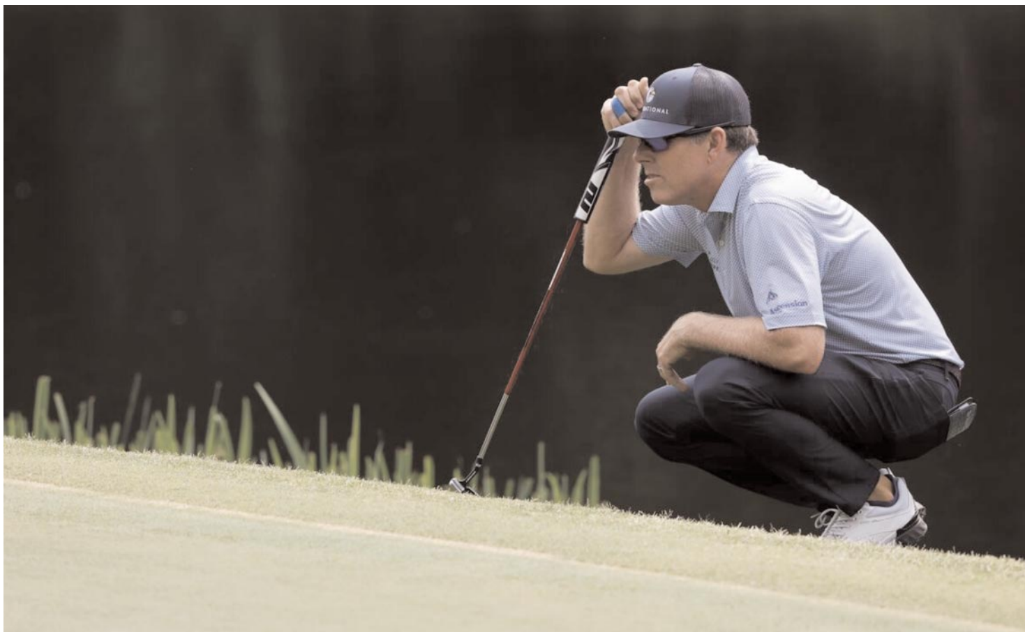
Leonard set for Senior PGA close to old Texas home on new course with bright future