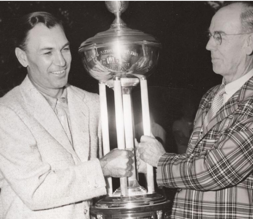
Ben Hogan will always be associated with Charles Schwab Challenge at Colonial

Television: Thursday-Friday, 3 p.m.-6 p.m. (Golf Channel). Saturday-Sunday, 12 p.m.-2 p.m. (Golf Channel), 2 p.m.- 5 p.m. (CBS). Radio: Thursday-Friday, 12 p.m.-6 p.m. ET. Saturday-Sunday, 12 p.m.-5 p.m.