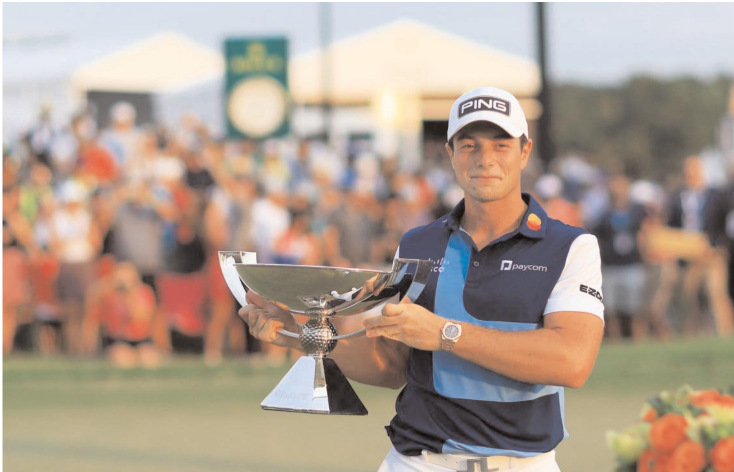
Defending champ Viktor Hovland is a fan of East Lake Golf Club