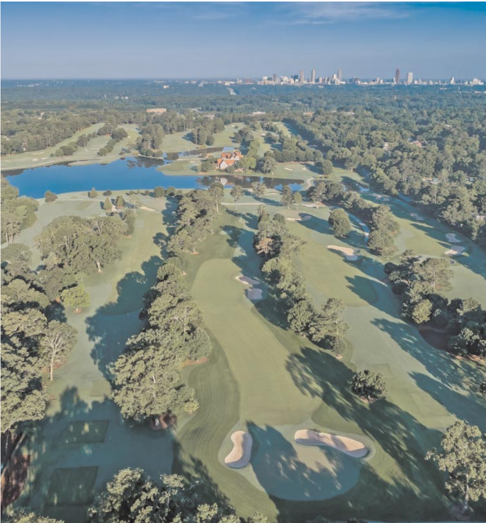
Views of the course's namesake body of water and the Atlanta skyline also were restored throughout the course