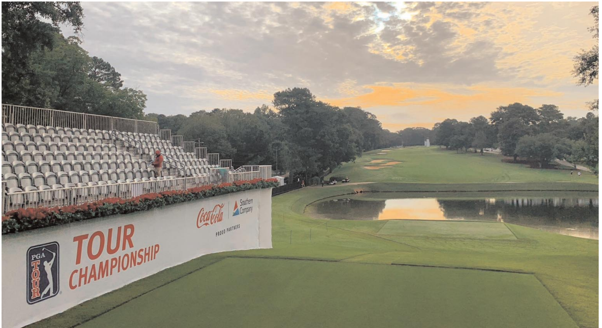
The eighth hole was turned into a short (and potentially drivable) par 4