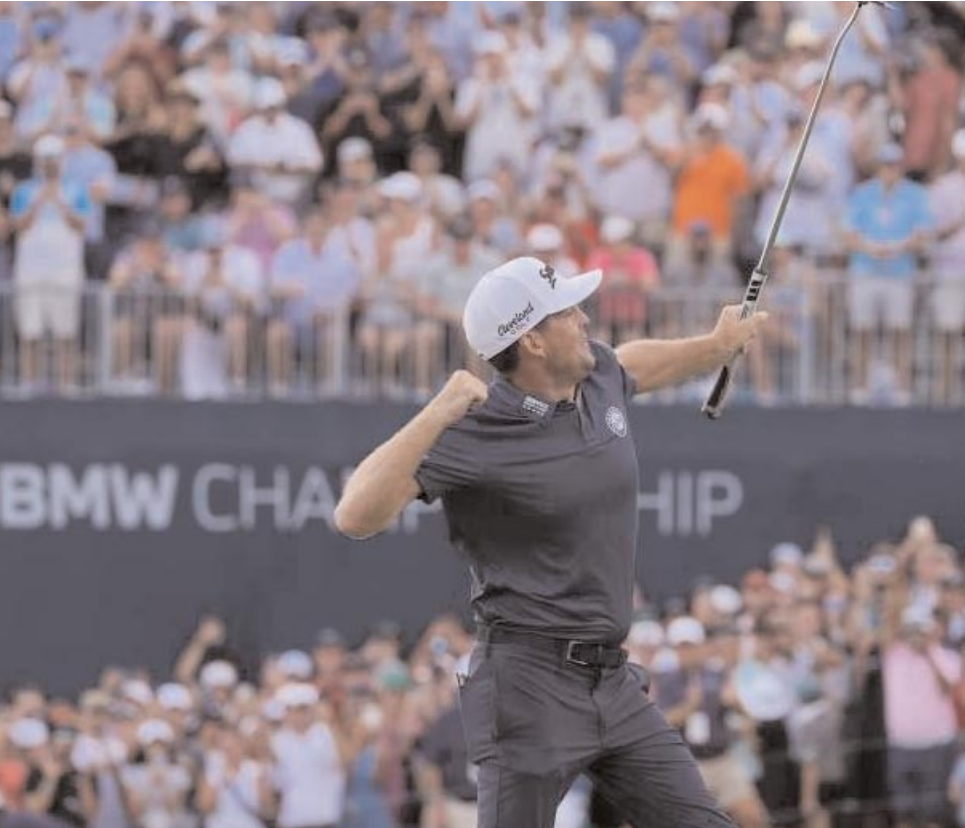
The champion will be the golfer with the lowest score in relation to par including their starting strokes and 72-hole score