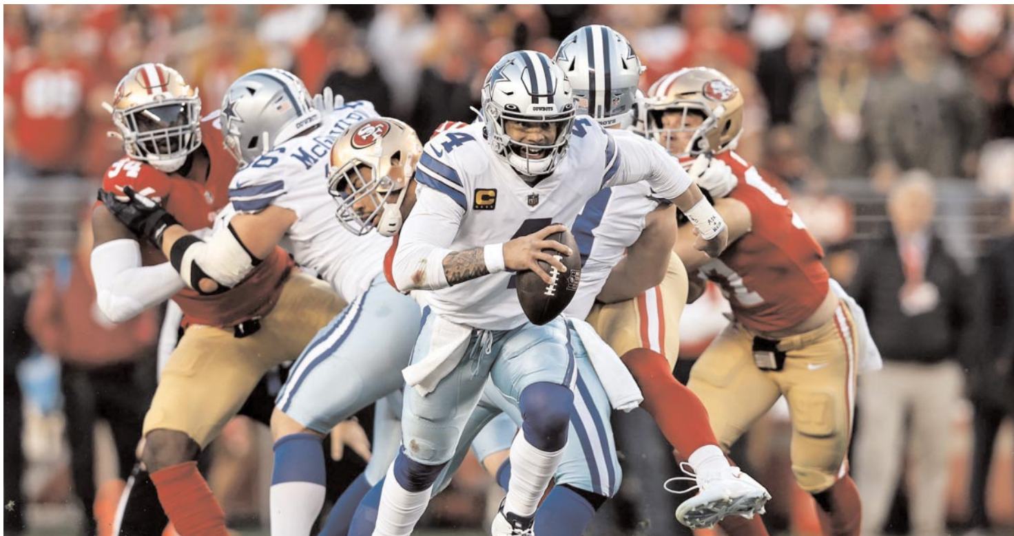
Cowboys quarterback Dak Prescott has won 12 games in three straight years