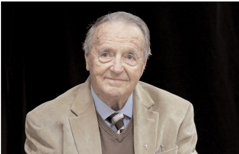
Bobby Bowden was saluted in a pregame tribute on ESPN