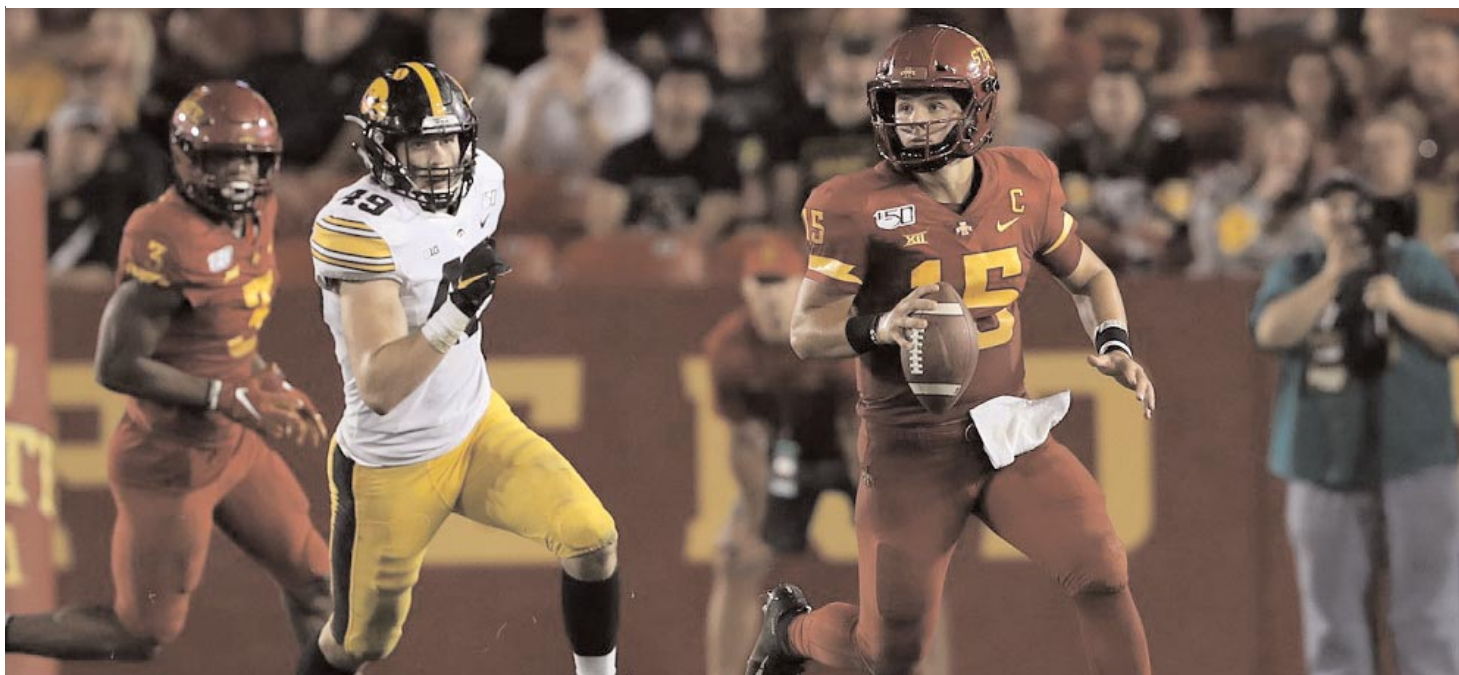
Iowa has won five in a row and six of the last seven