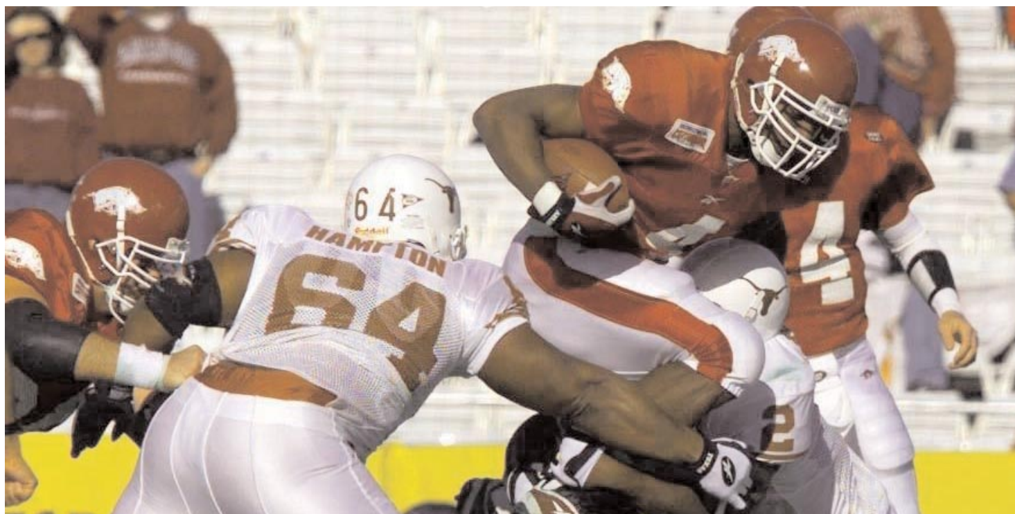
Texas travels to the hills this week to play old Southwest Conference rival Arkansas