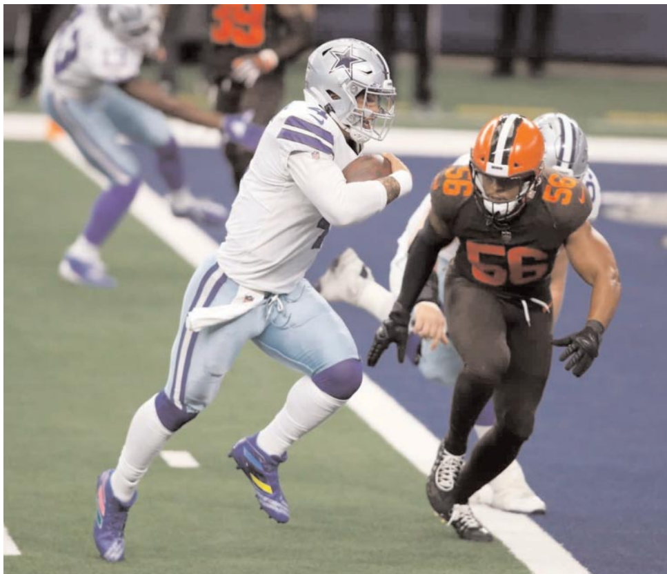
The Cowboys host the Saints this Sunday for the first home game of the season