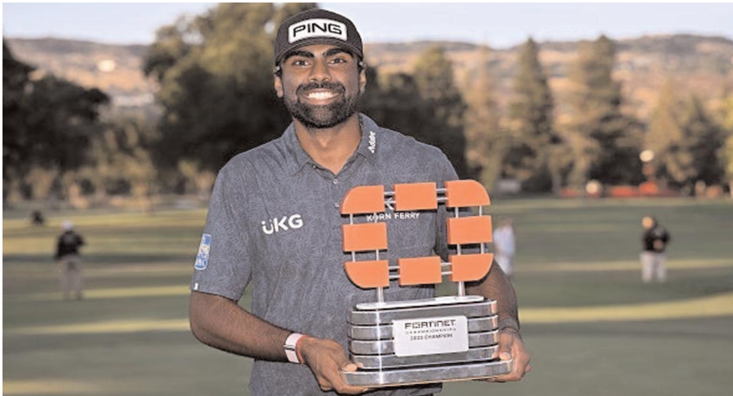
The FedExCup Fall offers players a chance to secure or improve their PGA TOUR status for the 2025 season