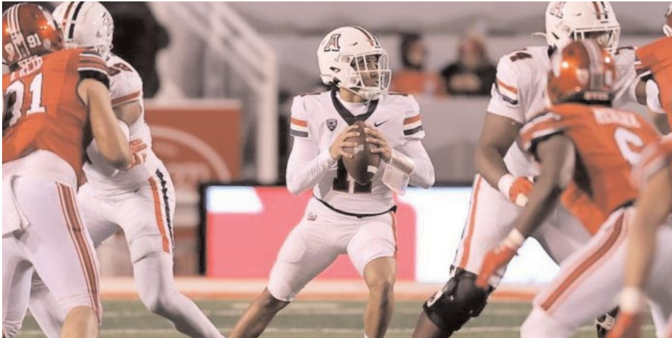
Arizona travels to Manhattan this week to take on K-State