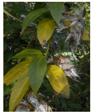
Going to seed on the Auburn trail in Pittsford.

...the black and pale swallow-wort ( Cynanchum louiseae , Cynanchum rossicum ) choke out other plants and that their toxic chemicals are poor fodder for animals? Any hatching Monarch butterfly larvae will not survive.