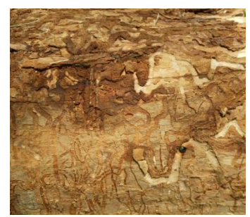
Ash borer trails in a downed ash tree in Henrietta.

...that the emerald ash borer ( Agrilus planipennis ) is killing ash trees in the Rochester area? One in every 10 trees in NYS is an ash.