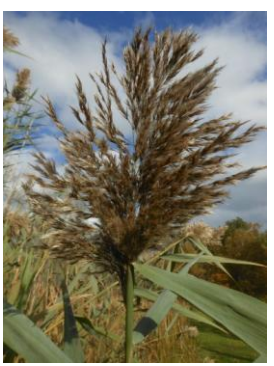
Phragmites in Powder Mill Park.

...that the European Common Reed (Phragmites australis subsp. australis) forms dense stands, reducing diversity in wetlands? Red winged black birds can use cattails for nest building but not these reeds.