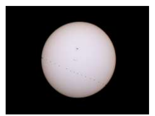
Composite image showing Mercury as it transits across the Sun.