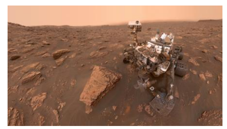
Mars Rover examining clay deposits.

Boron-rich clay deposits have been discovered on the surface of Mars by prior Mars expeditions. Clay deposits indicate the history of abundance and pH levels of water necessary for life. It so happens that boron-rich clays are hypothesized to have the surface chemistry required to catalyze the synthesis of ribose, a key component of RNA, not only a necessary catalyst for the synthesis of proteins from DNA but also are the carrier of genetic information in some viruses.