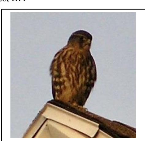
Photo of Falco columbarius , a Merlin falcon. The first nesting in Rochester in 60+ years was discovered in 2006. Photo Credit: Tim Tatakis, taken in 19th Ward.