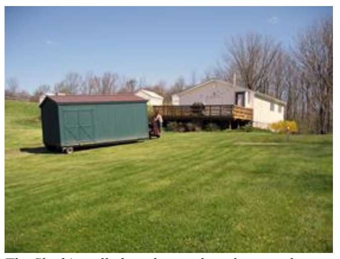
The Shed is pulled up the gentlest slope on the south lawn by a motorized "mule" to its site at the edge of the woods.