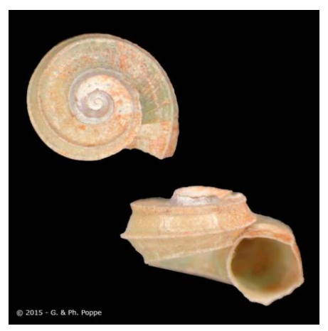
Valvata tricarinata

ability to better understand these environments is essential for gauging the susceptibility of wetlands to future climate change and understanding how climate change affect ecological succession as a whole at Zurich Bog. The grant paid towards the costs of Cornell University Stable Isotope Laboratory for analysis of organic samples (moss, sedge and lake algae) for weight % carbon, weight % nitrogen, and \delta_{13} C. It also covered costs of University of New Mexico's Center for Stable Isotopes analysis of Valvata tricarinata (gastropod) samples to obtain an average \delta_{13}C and \delta_{18}O for each sample depth.