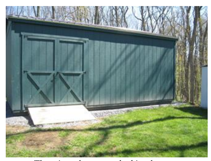
The mineral storage shed in place.