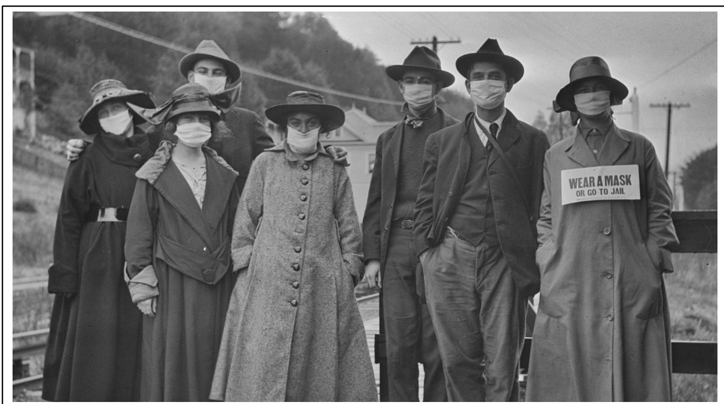
Face masks were a common sight in 1918 too, although advice about standing 6ft apart seems to have had little traction.