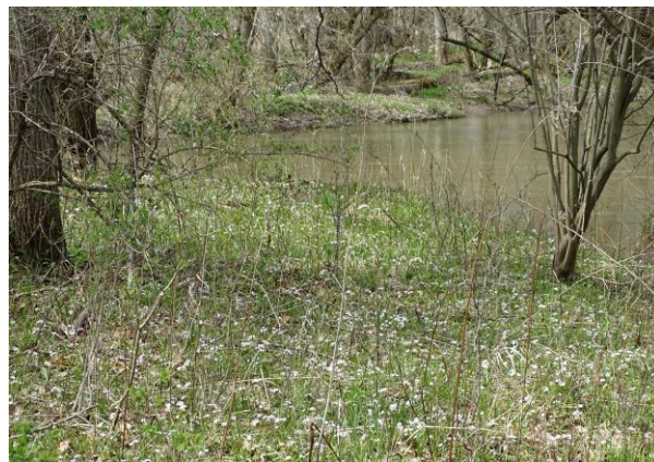
Fig. 5a: Photos of habitat along Honeoye Creek taken on May 1, 2020.

Figure 5 shows two photos taken of the same habitat in different months. In the May 1st photo, a dense population of Spring Beauty in bloom is visible among some other vegetation. On June 22nd, the area looks vastly different, with vegetation growing that will be blooming into summer and fall (e.g., grasses, goldenrod). The spring wildflowers described in this article will not be found in New York habitats for almost an entire year, but one can look forward to soon finding plenty of other plants that will be blooming in the summer or fall (e.g., milkweed, asters and goldenrod).