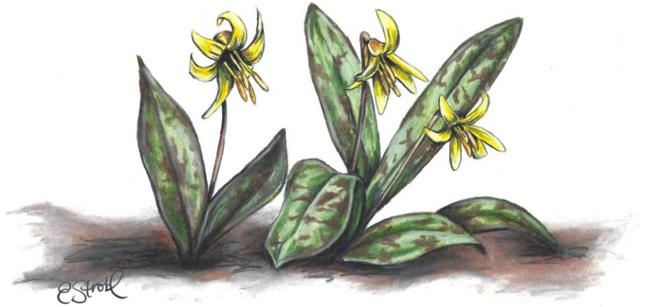
Fig. 2: Yellow Trout Lily ( Erythronium americanum ) Erin Strobl

The first species in bloom noticed this year was Spring Beauty ( Claytonia virginica ), a delicate little plant with white/pink flowers. If one looks closely, the generally white flowers contain lines of pink