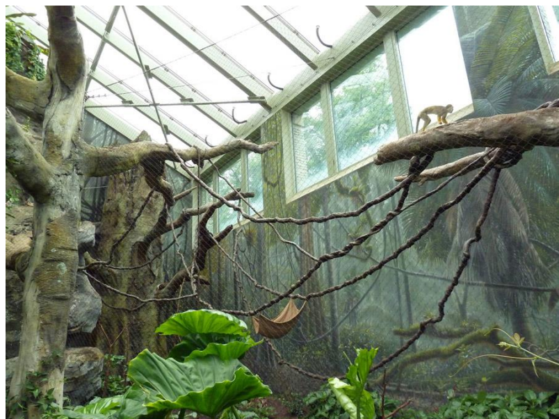
Buffalo Zoo M&T Bank Rainforest Falls exhibit. Upper right, common squirrel monkey, center left, black howler monkey. Buffalo Zoo