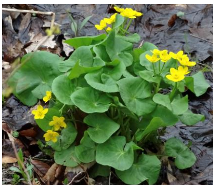
Fig. 4: Marsh Marigold ( Caltha palustris ).

Another plant with yellow flowers that was found in this habitat was Marsh-Marigold ( Caltha palustris ).