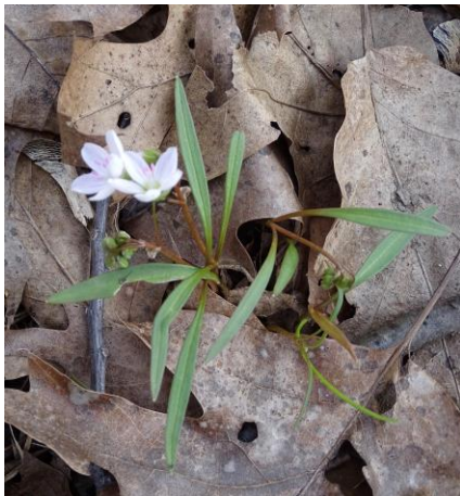
Fig. 1: Spring Beauty ( Claytonia virginica ). Tim Tatakis

There is a mixture of vegetation that grows in this area during the course of a year, including some trees, shrubs, herbaceous species, and many plants often associated with swamps and marshes, e.g. sedges and cattails. An interesting characteristic of this area is that it floods periodically. In some years, overflow from the creek covers the habitat with several inches of water. When it is flooded, it is difficult to imagine any small plants growing there. However, it does not stay flooded for long (perhaps a few days), and these spring wildflower species have managed to grow and survive in this type of habitat over time.