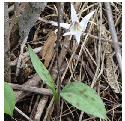
Fig. 3: White Trout Lily ( Erythronium albidum ). Tim Tatakis.

About a week after spotting the first Yellow Trout Lily in bloom, a plant closely related to it was found. Four individuals of the White Trout Lily ( Erythronium albidum ) were discovered in bloom (see Fig. 3). This species is much less common than the Yellow Trout Lily in New York State. It also appears to be less common in this habitat along Honeoye Creek. The largest number of White Trout Lily I saw in bloom on one day was four, while the maximum number of Yellow Trout Lily in bloom on any day was twenty.