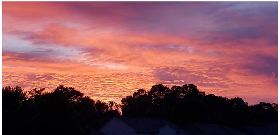
Red Sky Over Northern Georgia.

As many of you know there are trade winds that move weather systems (low pressure zones) across the Atlantic. Weather forecasters will track these low-pressure systems westward across the Atlantic to see if any will turn into hurricanes or other storms (see satellite photo next page). In addition to hurricanes the western hemisphere gets millions of tons of Saharan dust from Africa. This accounts for about 70% of all the global dust. This dust can bring important minerals that fertilize soils in the Caribbean Basin, the Amazon and even parts of Central and North America. There is even evidence that this