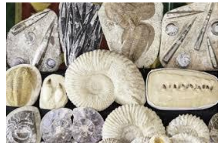
The Biologist 62(4) p28-30