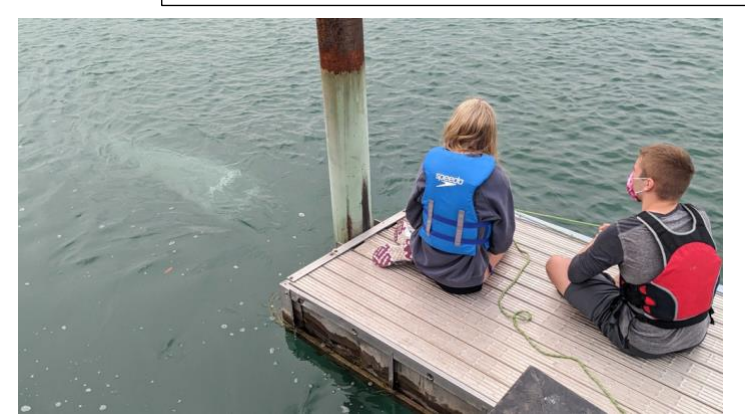
Characterization of the lower Niagara River copepod diet and phytoplankton community composition using 16S rRNA and 18S rRNA gene sequencing.

The following are a few abstracts from students receiving awards for the 2023-2024 year.