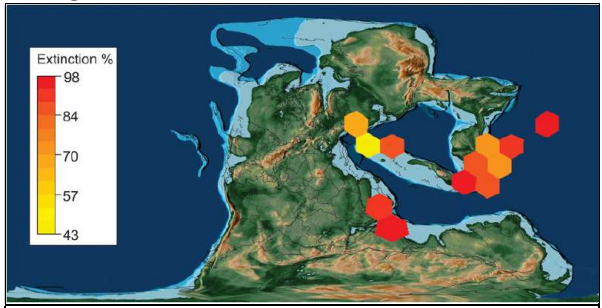
Foster et al. Figure 1. Proportional extinctions of marine genera during the end-Permian mass extinction event in different regions. (Note North America in center, South America & Africa in bottom center.) Each hexagon cell represents an equal area, and only cells that include both pre- and post-extinction data are included.

For each genus, twelve of these criteria were analyzed. Did certain traits make a given organism more likely to survive under the conditions prevalent at the end of the Permian – or not? With the aid of "machine learning", a method from the field of Artificial Intelligence, all of these factors were analyzed jointly and simultaneously. Once this was done, the team determined what organisms were there before, during and after the mass extinction.