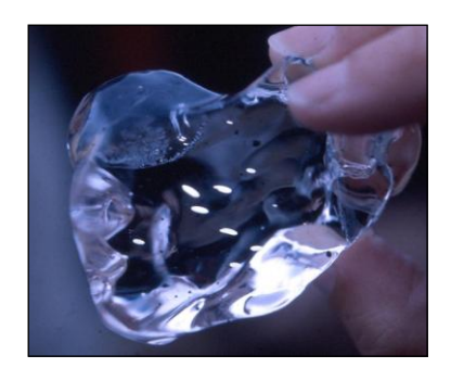
Glacial air bubbles, like these from an Icelandic glacier, hold clues to atmospheric conditions at time of entrapment.