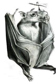
From GH Ford, proceedings of the Zoological Society of London-1862. In public domain UK & US, PD-1996. http://en.wikipedia.org/wiki/Hypsignathus_monstrosus

...that Hypsignathus monstrosus , a large fruit bat hunted as bushmeat in equatorial Africa, may carry Ebola without getting ill?