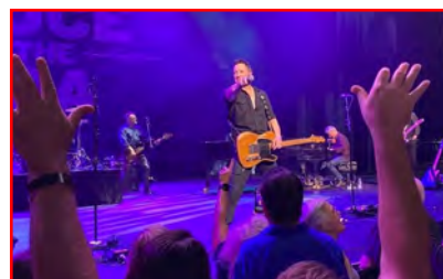
Our Artist Partners Rocking Cancer

We Rock Cancer (WRC) is a veteran-founded 501(c)(3) organization that harnesses the power of music and health care partnerships to advocate for early detection of skin cancer. Early detection substantially increases the survivability of skin cancer. According to the American Cancer Society, metastasized melanoma has a survivability rate of 27%, but when diagnosed early, 99% of people recover. We bring free professional skin cancer screenings to concerts and music festivals, and other outdoor events like community fun runs and races, and we provide artists with the opportunity to perform for new audiences at new venues.