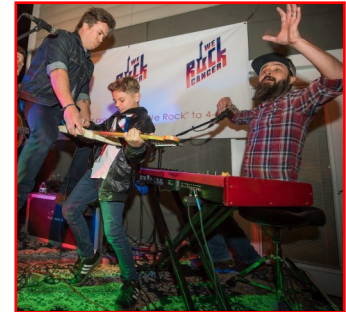
Our Artist Partners Rocking Cancer

We Rock Cancer (WRC) is a veteran-founded 501(c)(3) organization that harnesses the power of music and health care partnerships to advocate for early detection of skin cancer. Early detection substantially increases the survivability of skin cancer. According to the American Cancer Society, metastasized melanoma has a survivability rate of 27%, but when diagnosed early, 99% of people recover. We bring free professional skin cancer screenings to concerts and music festivals, and other outdoor events like community fun runs and races.