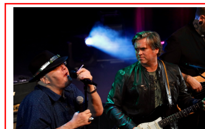
Our Artist Partners Rocking Cancer

We Rock Cancer (WRC) is a veteran-founded 501(c)(3) organization that harnesses the power of music and health care partnerships to advocate for early detection of skin cancer. Early detection substantially increases the survivability of skin cancer. According to the American Cancer Society, metastasized melanoma has a survivability rate of 27%, but when diagnosed early, 99% of people recover. We bring free professional skin cancer screenings to concerts and music festivals, and other outdoor events like community fun runs and races, and we provide artists with the opportunity to perform for new audiences at new venues.