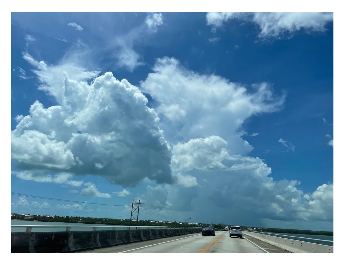
Finally, I arrived at the hotel. I chose an off-label hotel, only to find out it is a Curio collection of Hilton.