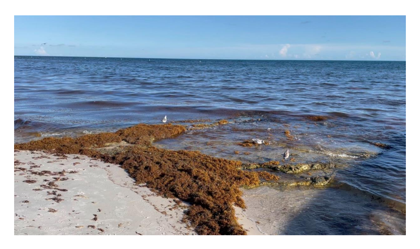
A couple of videos – that I am learning to use.