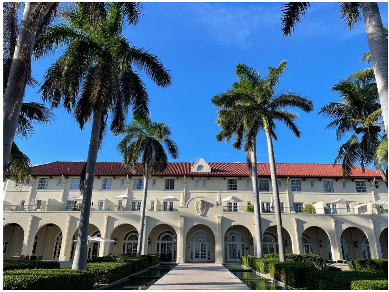
It's delightful. Casa Marina Key West.