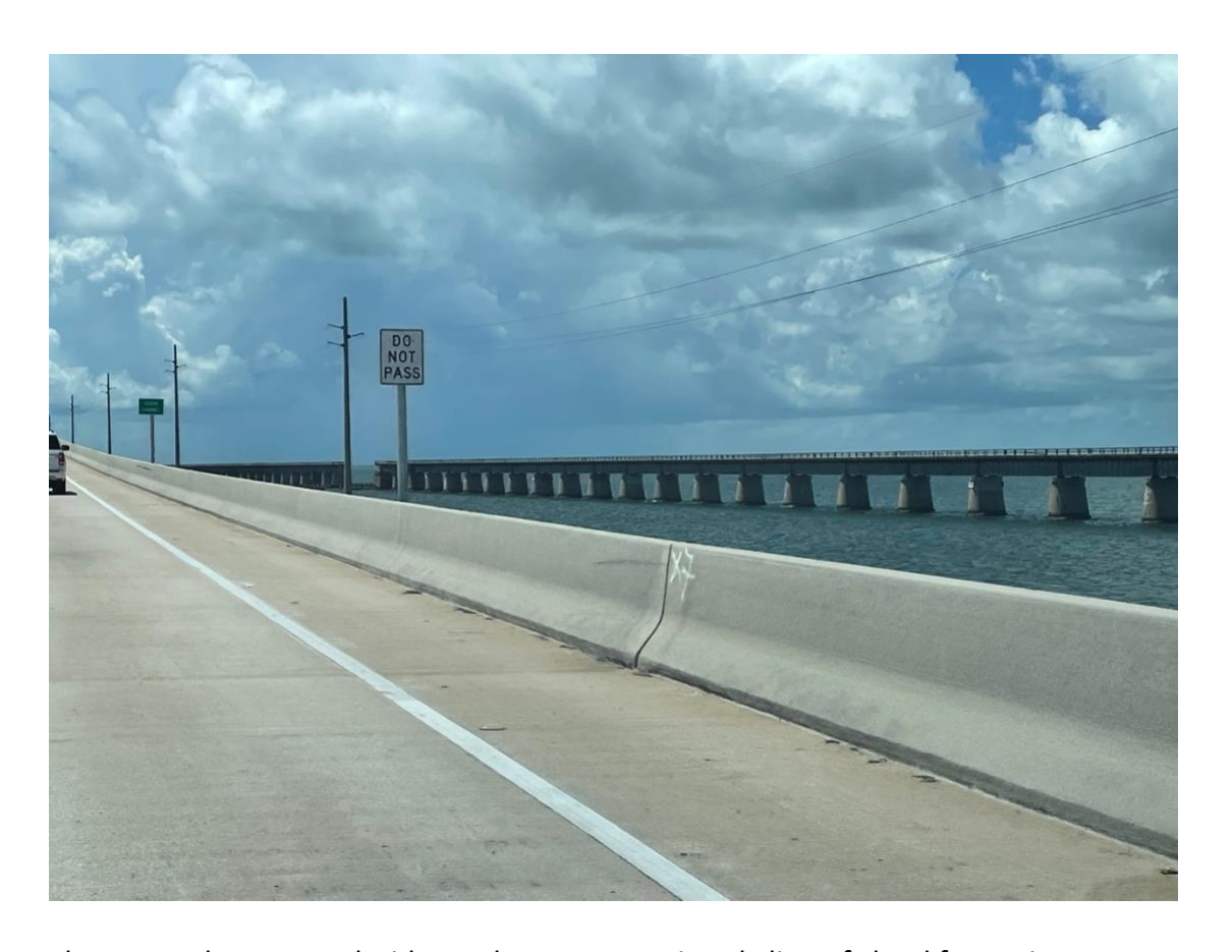
The atmosphere over Florida produces an amazing skyline of cloud formations.