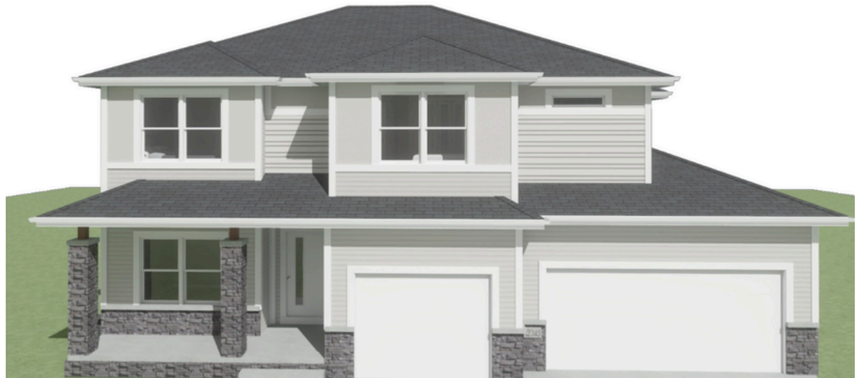
Modern Prairie Elevation