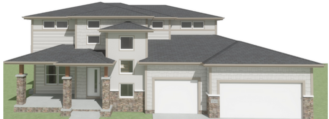
Modern Prairie Elevation