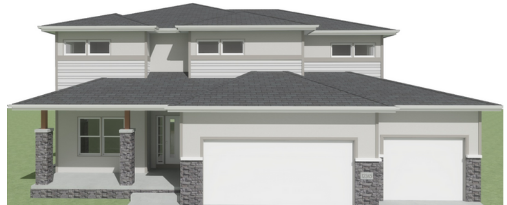
Modern Prairie Elevation