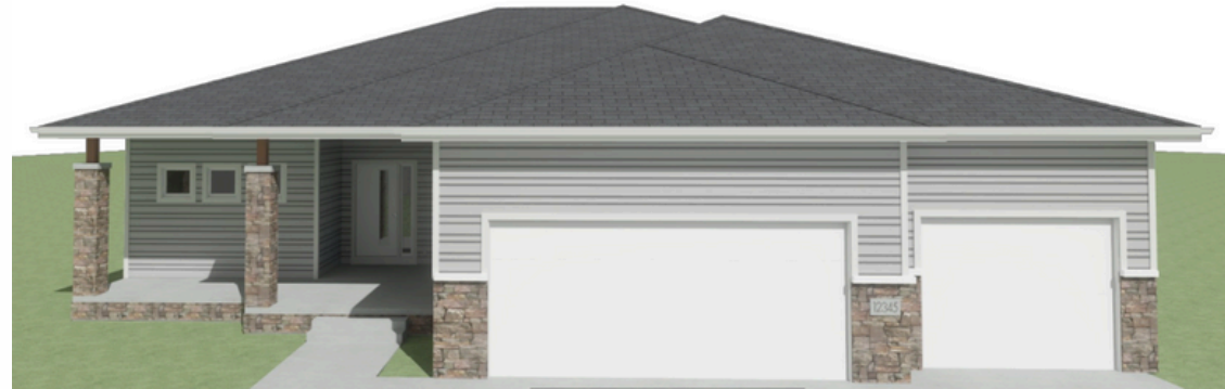
MODERN PRAIRIE ELEVATION