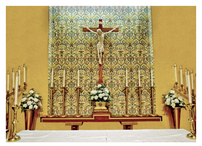
View of the Main Altar, Christ Church, Rosedale

With thanksgiving we recall that the Evangelical Lutheran Church of Christ is celebrating its 110th anniversary. This gives us the opportunity to bring to the attention of all our LC–I congregations and members the special ministries of Word and Sacrament that are enjoyed throughout the Synod. To that end, we hope that all of our congregations will provide information, photos, and articles for us to highlight in future issues of the BULLETIN.