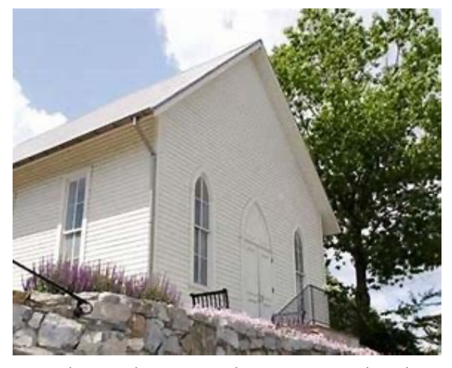
Holy Family Episcopal Missionary Church 26130 Frederick Road Clarksburg MD 20871 (Parking is available on the North side of the chapel.)