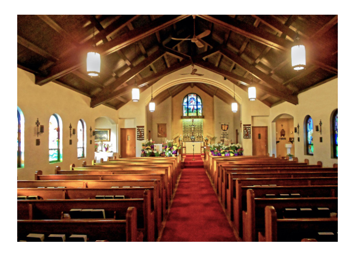
Interior View, Christ Church, Rosedale