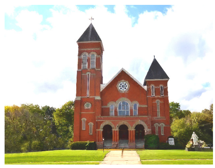
First Lutheran Church, Lyons, New York LC-I Headquarters Church and Archbishop's Office