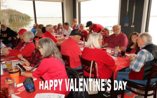
HAPPY VALENTINE'S DAY