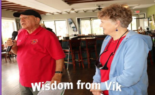
Wisdom from Vik