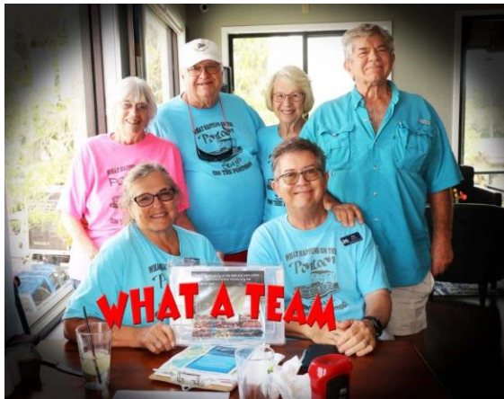
Scavenger Hunt Winners

Enjoyable day out on the water, Lake Eustis, for the scavenger hunt.