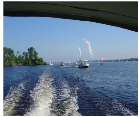
Florida Cross Barge Canal