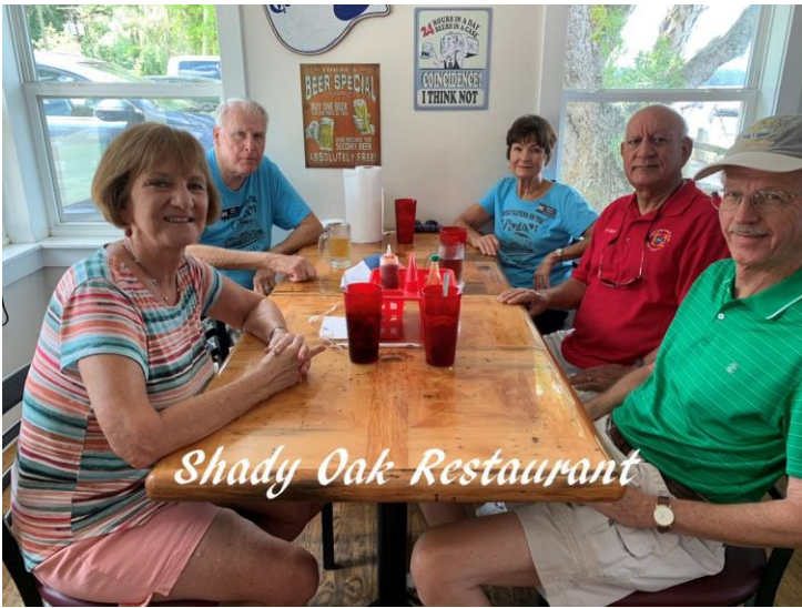
Shady Oak Restaurant