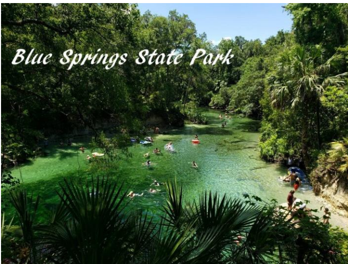
Blue Springs State Park