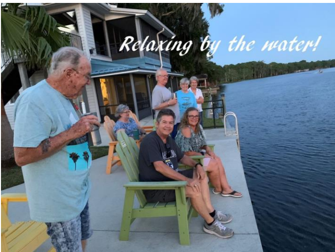
Relaxing by the water!