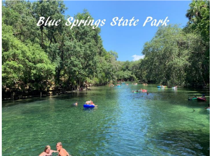
Blue Springs State Park