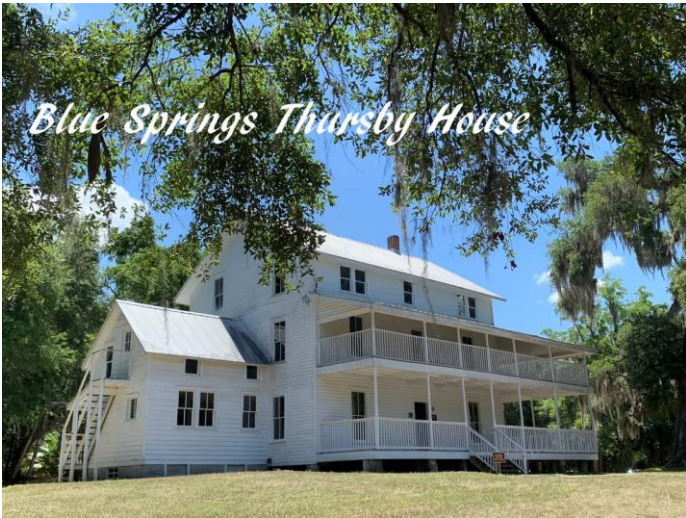
Blue Springs Thursby House