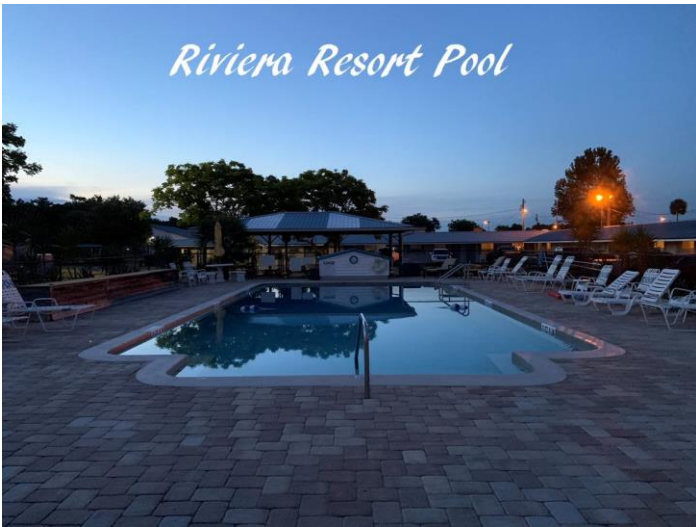
Riviera Resort Pool