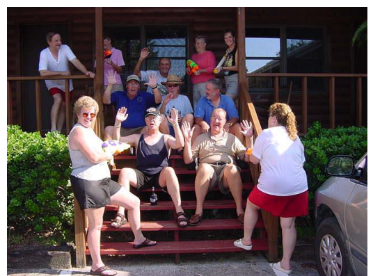
The ladies have corralled the water gun fighters.