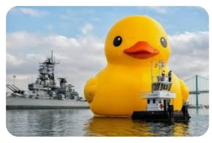
The ducks are arriving 2023. Stay tuned.