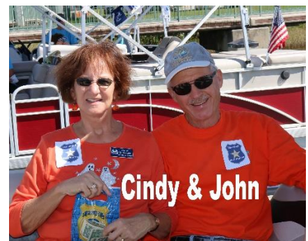
The winning investigative team!