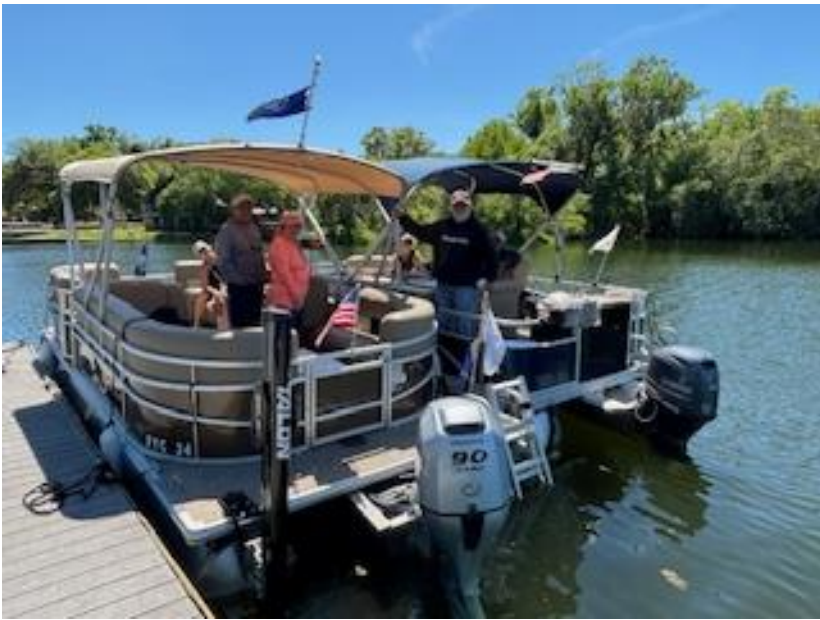
Everyone was having a beautiful, enjoyable day on the water