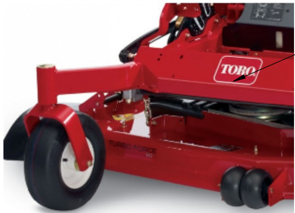
HITCH MOUNT LOCATION