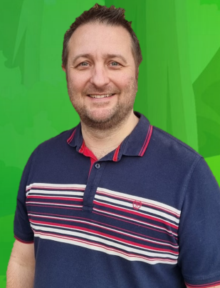
SHERIFF OF NOTTINGHAM