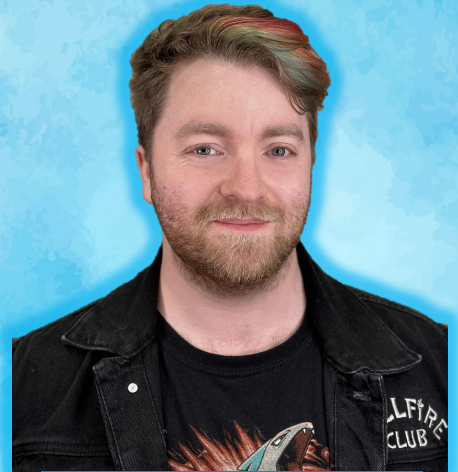
DAME FITZNICELY NICO WHITNEY-BAMFORD